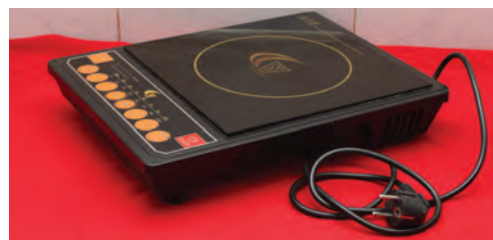
An electric hot plate