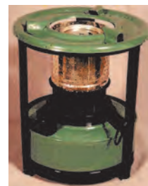
A kerosene stove with wicks