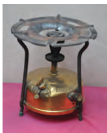
A kerosene stove with a burner

Some people use the heat from the sun for cooking. They use the solar cooker.