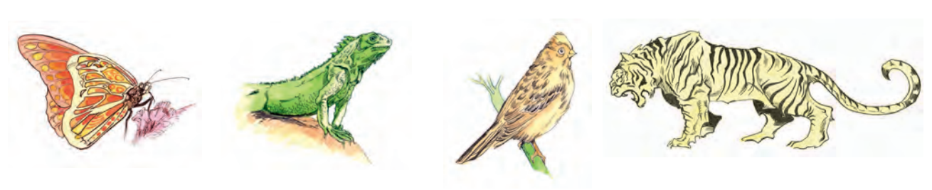
The animal world