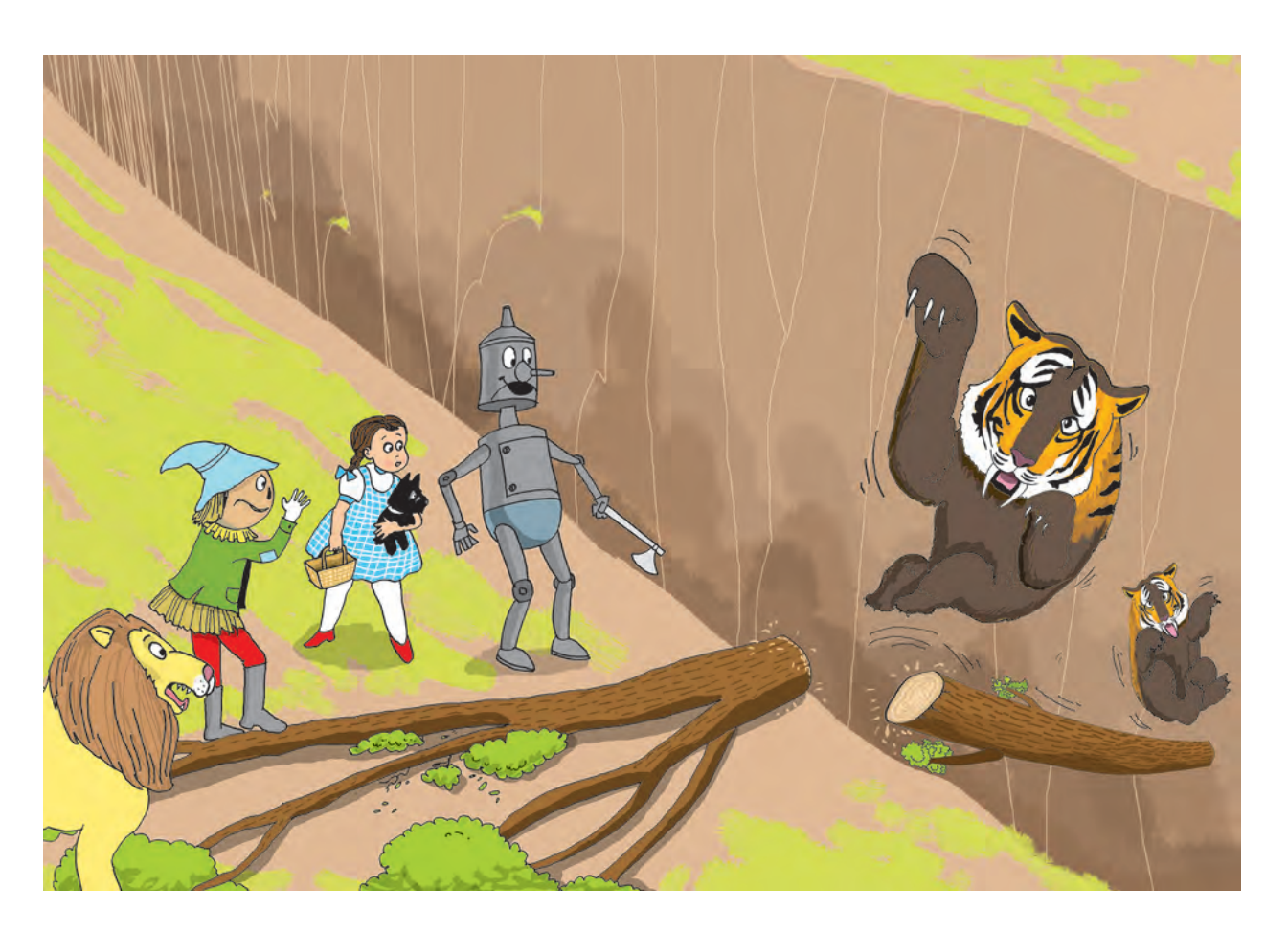
fight them as long as I am alive."

"Wait a minute!" called the Scarecrow. He had been thinking what was best to be done, and now he asked the Woodman to chop away the end of the tree that rested on their side of the ditch. The Tin Woodman began to use his axe at once, and, just as the two Kalidahs were nearly across, the tree fell with a crash into the gulf, carrying the ugly, snarling brutes with it, and both were dashed to pieces on the sharp rocks at the bottom.