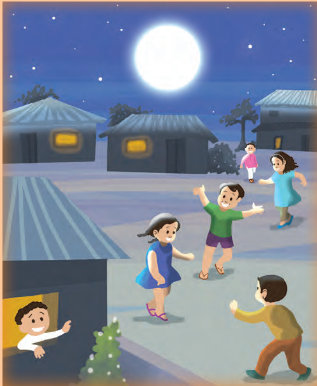
Bring the hoop, and bring the ball, Come with happy faces all;

Let us make a merry ring, Talk and laugh, and dance and sing