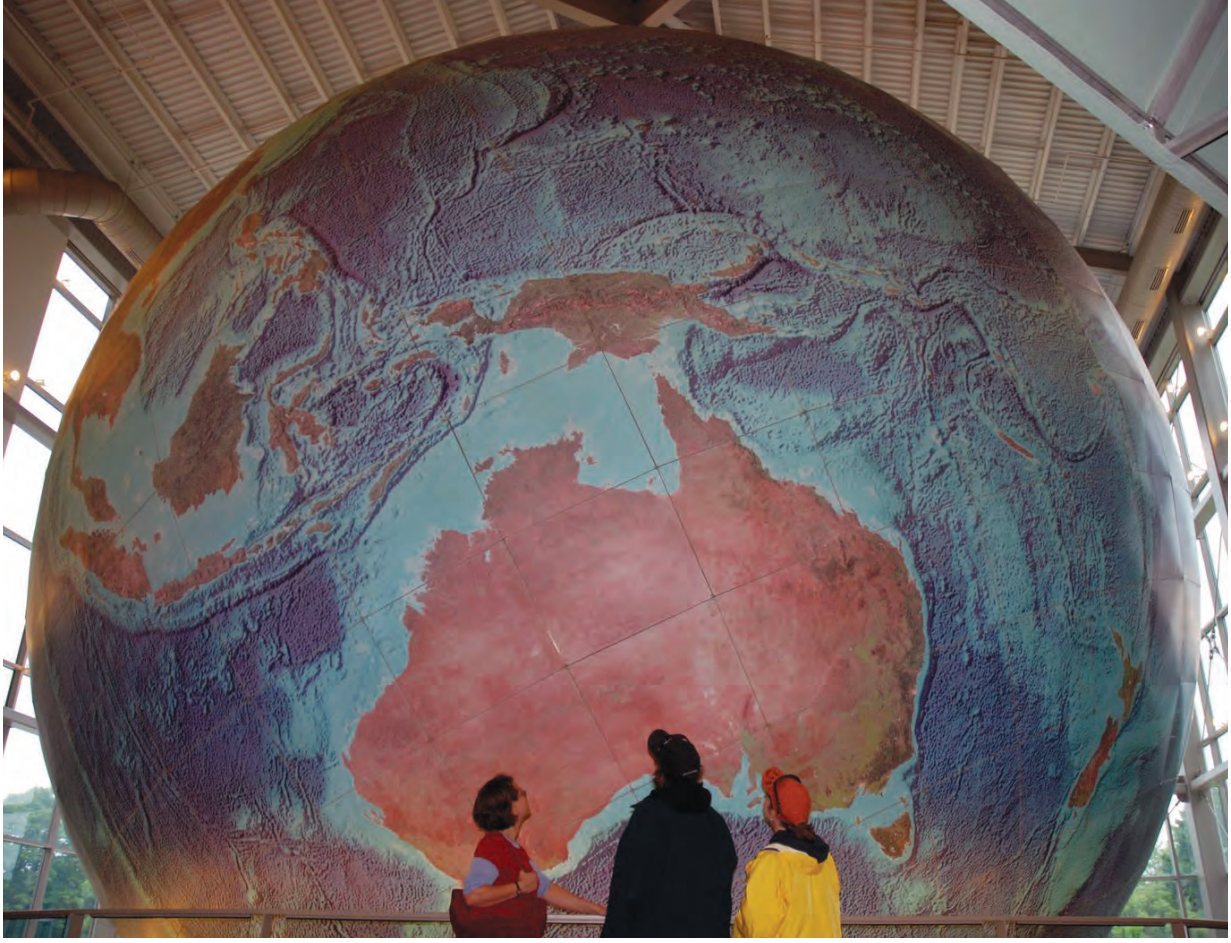
Figure 3.2 : Eartha

Maine in the United States of America. The rotation and revolution speed of this globe is maintained as per that of the earth.