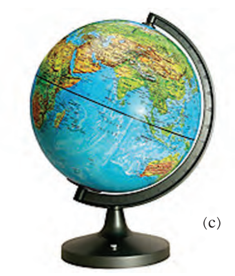
Figure 3.1 : (a) World Map, (b) Outline Map of India, (c) A Globe