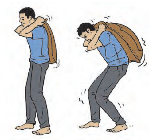
10.7: Carrying a load