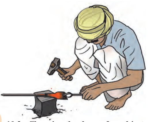
10.2: Changing the shape of on object

Force is necessary to change the shape an object.