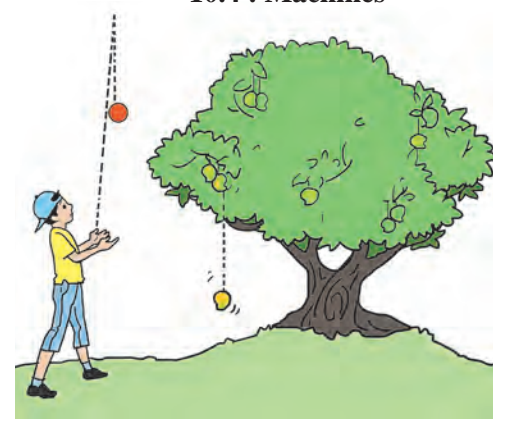
10.5: Falling down of a ball and a mango