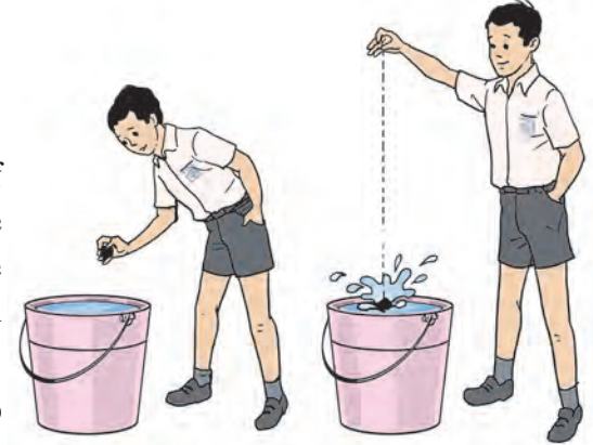
10.6: Dropping a stone in water

The object comes to rest when the tension in the spring and the gravitational force on the object become equal. In this position, the scale on the spring balance shows the gravitational force acting on the object which is the weight of the object. The gravitational force acting on an object is called the weight of that object.