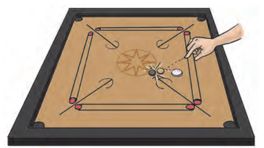
10.8: Frictional force