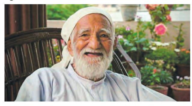
Environmentalist - Sunderlal Bahuguna

However, demographic and economic factors led to indiscriminate use of forests and led to deforestation. Processes of industrialisation and development led to improvement in the means of transport and communication. People involved in developmental projects challenged the established claim of local people on forests. Loss of means of livelihood affected and angered people leading to the emergence of the movement. In April 1973, when the contractors along with the workers reached Mandal village to cut trees and to clear jungles spaces allotted to them by the State government, the inhabitants hugged the trees, to resist and to mark their protest. The action happened at a mass level, as a result of which the authorities had to retreat. The women of the village also participated in the protest. This incident boosted the morale of several other groups facing similar problems to get together and to protest against deforestation.