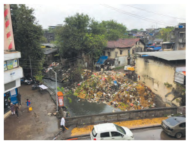
Trash disposal is a problem in cities

(9) Trash disposal : As Indian cities grow in number and size the problem of trash disposal is assuming alarming proportions. Huge quantities of garbage generated by our cities pose serious health hazards. Most cities do not have proper arrangements for garbage disposal and the existing landfills are full to the brim, which become hotbeds of disease and innumerable poisons into the environment. Wastes putrefy in the open, inviting diseasecarrying flies, mosquitoes and rats. Also, a poisonous liquid called leachate is emitted, which contaminates ground water. People who live near the rotting garbage and raw sewage fall easy victims to several diseases like dysentery, malaria, plague, jaundice, diarrhea, typhoid, dengue and leptospyrosis.