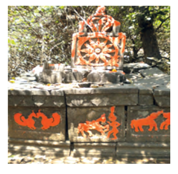
"Suryadev Mandir" (Temple of the Sun God) at Kasatvadi Village, Jawahar Taluka, Dist. Palghar

(7) Simple religion : Their forms of religion are known as 'animism' (i.e. worshipping the soul or ancestors), 'animatism' (i.e. worshipping any non-living body like stone or wood), 'totemism' (i.e. worshipping a tree or any animal as the founding 'naturism' (i.e. worshipping ancestor). elements of nature like river, stream, Sun, Moon, forest, etc) and 'manaism' (i.e. worshipping force which is believed to move swiftly across the world and enter into objects and people, giving them powers which they previously lacked). Sacred groves are an integral part of tribal society. They also have belief in black and white magic, ancestor worship, benevolent and malevolent spirits.