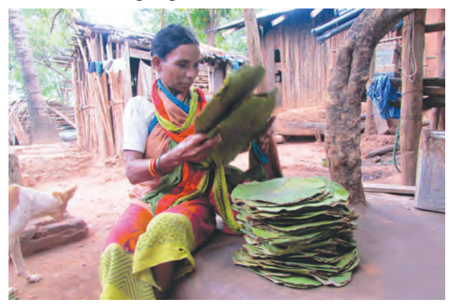
Tribal economic life

(6) Simple society : Tribal communities are considered as simple societies because their social relationships are primarily based on family and kinship ties. Besides, they do not have any rigid social stratification. They have their own faith systems based on natural phenomenon and beliefs in evil forces. Based on it they have a traditional pantheon of gods and goddesses. Traditionally, they have had a marginal degree of contact with other cultures and people.