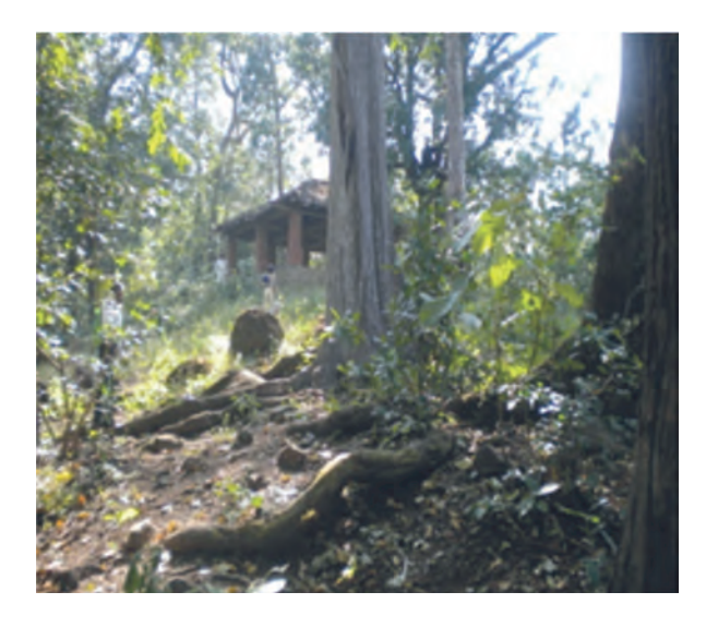
"Shedoba cha van" (Forest of Shedoba) Sacred grove in Murbad Taluka, Dist. Thane

(8) Community administration : Each tribe has its own distinct ways of community administration, meant for solving various individual and community issues. They manage the internal community issues through