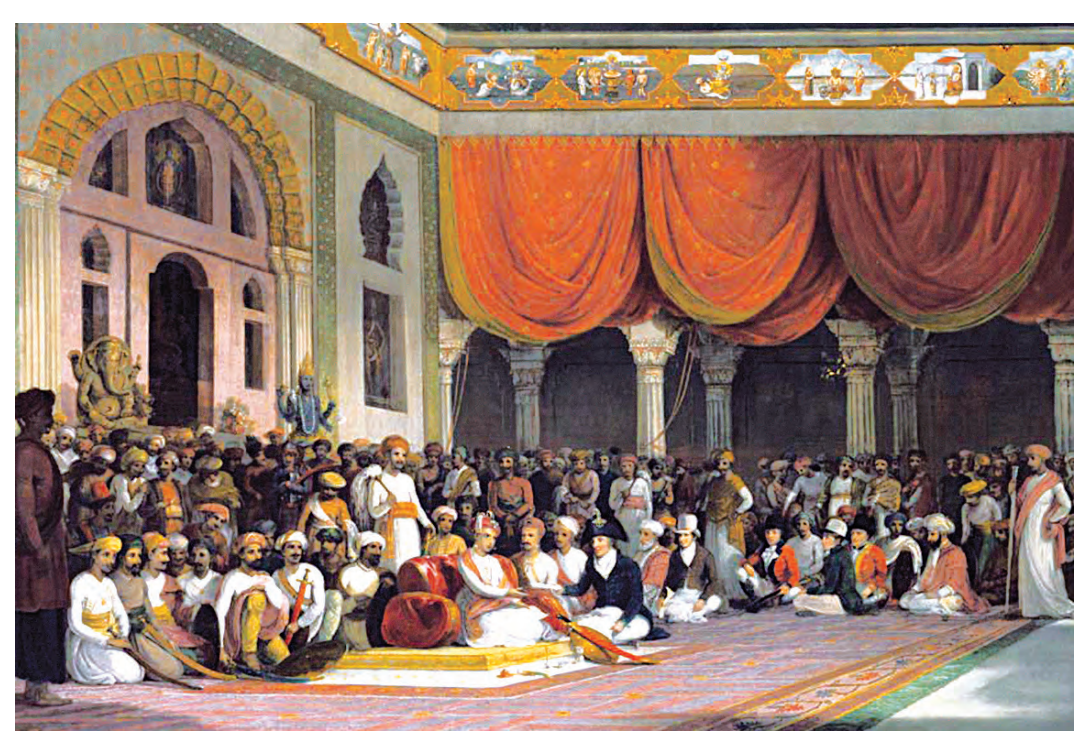
The Court of Sawai Madhavrao Peshwa