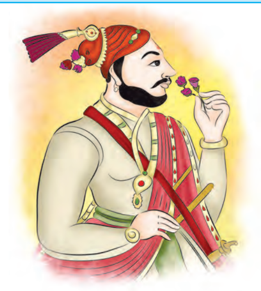
Chhatrapati Sambhaji Maharaj

Sambhajiraje speaking... Present a role play.