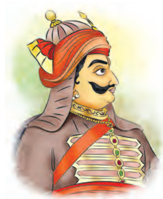
due to his qualities Maharana Pratap of valour, courage, self-respect, sacrifice, etc.