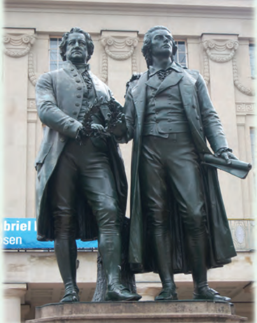
Goethe und Schiller