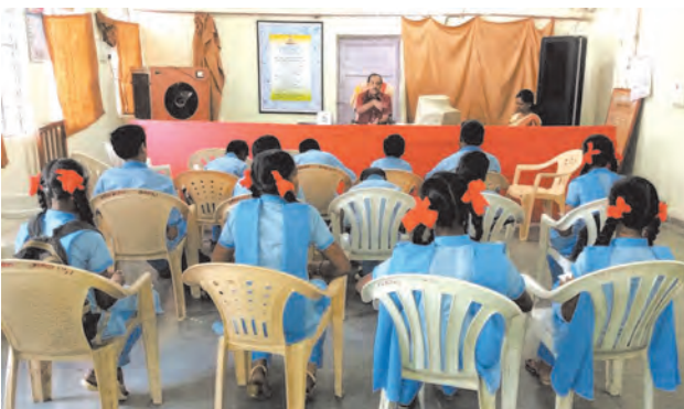
Figure 10.1: Visit to the election office

Prepare a plan for a fieldtrip of your class to a place of special interest/visit to an office and prepare a questionnaire.