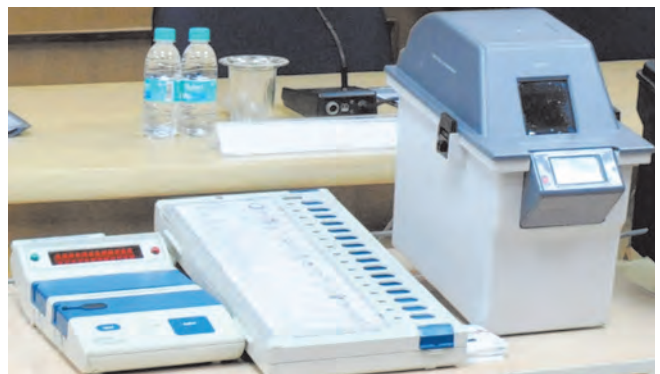
Figure 10.4: Electronic Voting Machine