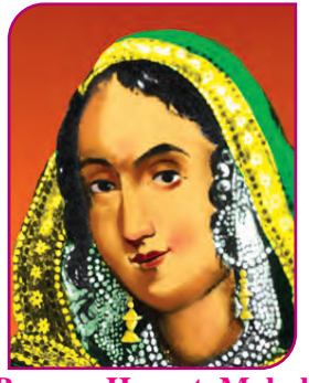
Begum Hazrat Mahal