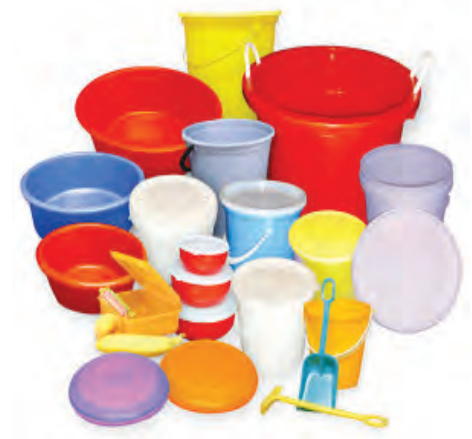
17.1 Plastic material

Depending upon the effect of heat, plastic can be classified into two types. The plastic that can be molded as per our wish is called as thermoplastic. eg. Polythene, PVC are used for manufacturing the toys, combs, plates, bowls etc. Another plastic is such that once a specific shape is given with the help of mold, its shape cannot be changed on heating. It is called as thermosetting plastic. eg. Electric switches, coverings over the handles of cookers, etc.