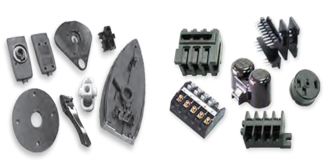
17.3 Theromosetting plastic