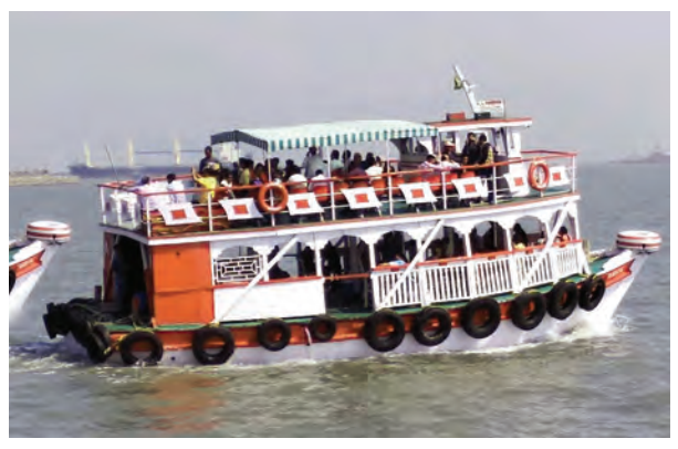
3.2.5 Shipping launch

Today there are many options available for transportation. In this the cheapest option is shipping. There are some major shipping ports in India. E.g. Kandla, Mumbai, Cochin,