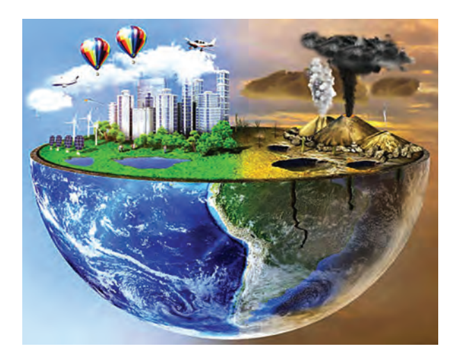
3.2.7 Environmental imbalance

All living organisms need water to drink, as well as crops, forests and various plants also need water. Soil and rock formations are also affected by water. After all, there is no life without water. Water alone maintains the balance of all the organic-inorganic elements in nature and water helps to protect the food chains in nature including plants, animals, birds, insects.