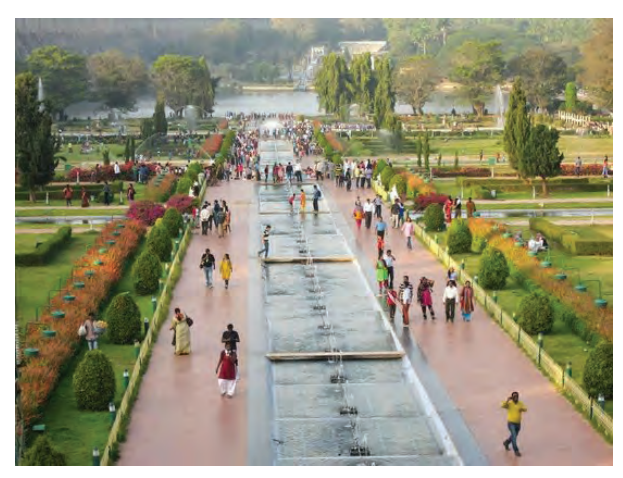
3.2.6 Tourist places

Sanitation. all amenities. attractive gardens, swimming pools, accommodation and, most importantly, abundance of water are tourist important destination. Musical fountains of water can be seen in tourist places. In Maharashtra, Aurangabad - Jayakwadi project, Dnyaneshwar Udyan in Paithan, Anand Sagar in Shegaon and in some other places artificial waterfalls a breathtaking view are developed. Many migratory birds from other countries come to the reservoir. E.g. Bharatpur, (Rajasthan), Ujani Dam - Reservoir (Maharashtra)