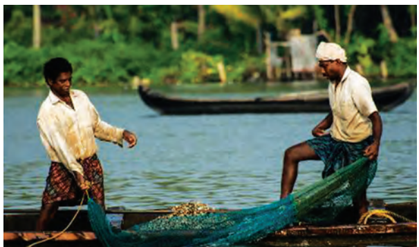
3.2.4 Fishing and Fisheries

The business generates huge financial turnover on the coast as well as in many port areas. In Maharashtra, fishing is done by producing fish seeds/eggs in small and big dams. Also, as a supplementary business to agriculture, fish farming is practiced in farm puddle/lake/pond and small ponds. It is generating huge economic output.