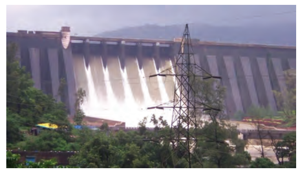
3.2.3 Koyna dam

Many dams in the country generate electricity. The water from the dam is used for