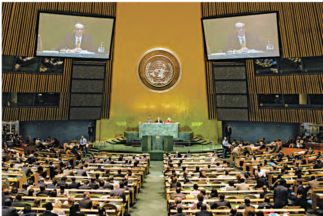
United Nations-General Assembly