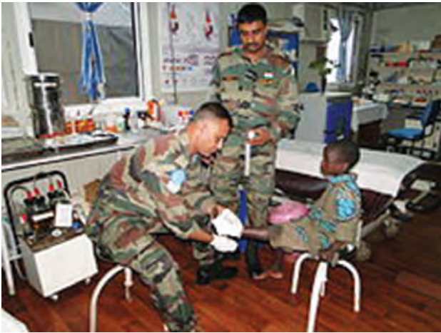
Indian Peacekeeping Forces

United Nations Peacekeeping : The peacekeeping activity of the United Nations involves creating appropriate circumstances favourable for bringing about permanent peace in strife-torn areas. The peacekeeping forces help these areas to progress towards peace. In conflict-ridden areas, security is provided and at the same time, help is extended for