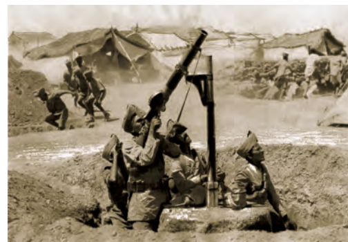
Indian Soldiers on a battlefield in the First World War

League of Nations was established after the First World War to establish peace. But it did not succeed at preventing war. Autocratic regimes came up in Germany, Italy, Spain and other countries. All these developments culminated in the Second World War.