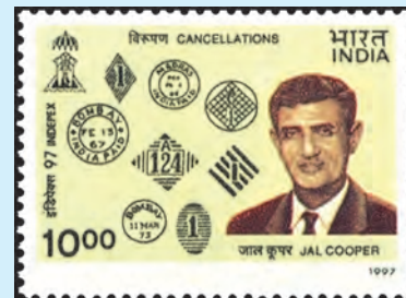
Jal Cooper Postage Stamp

The Indian government issued the 'Jal Cooper' stamp in 1977. Jal Cooper was an internationally acclaimed philatelist, i.e. an expert on the subject of 'postage stamps'. Born in a Parsi household in Mumbai, Cooper edited 'India's Stamp Journal'. He was the founder of the first Philatelic Bureau in India, an office that collected stamps. He founded the 'Empire of India Philatelic Society'. He went on to write many books on this subject. He gave a scientific bent to his hobby. He played a pivotal role in taking the study of Indian postage stamps to the international level. Having started his career as a postage stamp collector, Cooper achieved the expertise of a philatelist at the international level. The postage stamp on Jal Cooper is an important source to understand his significant contribution to this field.