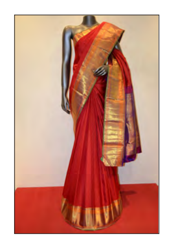
Pic. No. 3.13 Zari saree

Zari fabrics need special care in handling and storage. They have to be wrapped in muslin cloth to avoid friction and effect of natural elements. They can get damaged if washed at home and so need to be dry cleaned. Spray of perfumes should be avoided as it may tarnish the metal.