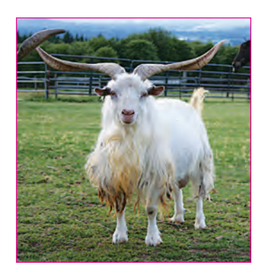
Pic. No. 3.5 Cashmere goat

The cashmere goat is a special type of goat originally found in Kashmir. The word Cashmere is an anglicisation of the word Kashmir. Today, this goat is bred in many different countries.