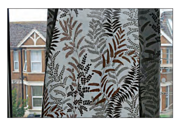
Pic. No. 3.12 Glass curtains