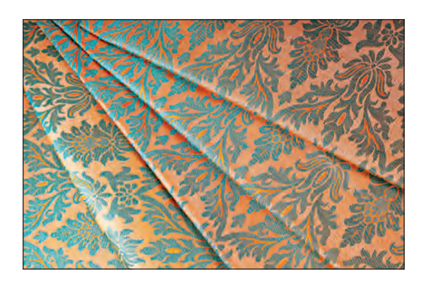
Pic. No. 3. 14 Brocade