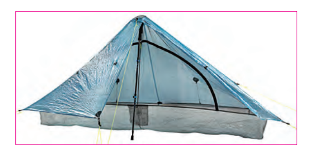
Pic. No. 3.9 Tent poles

Find out the full forms of GFRC and GFRP from internet. Also find out other uses of these materials.