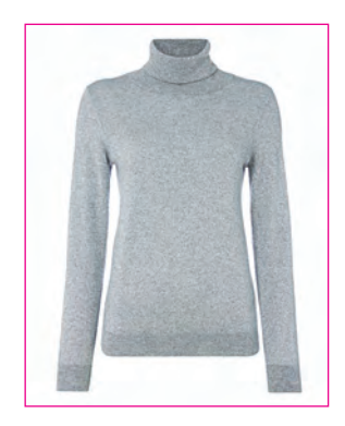
Pic. No. 3.6 Cashmere sweater