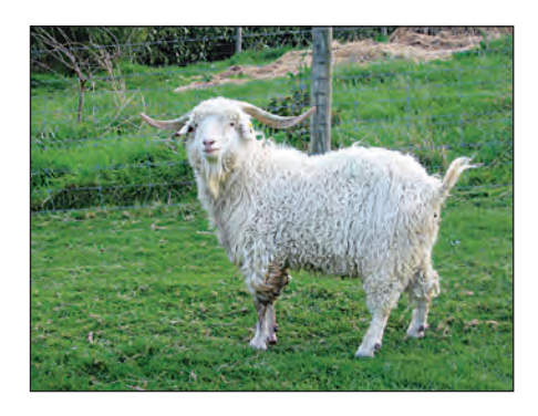
Pic. No. 3.3 Angora Goat

The word Mohair is derived from the Arabic word Mukhayyar which means "fabric made from hair of goat".