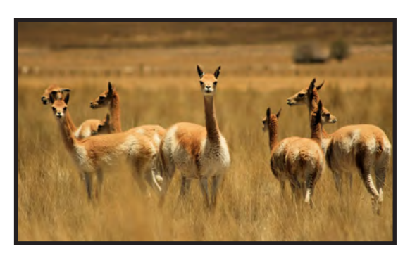
Pic. No. 3.7 Vicuna animal