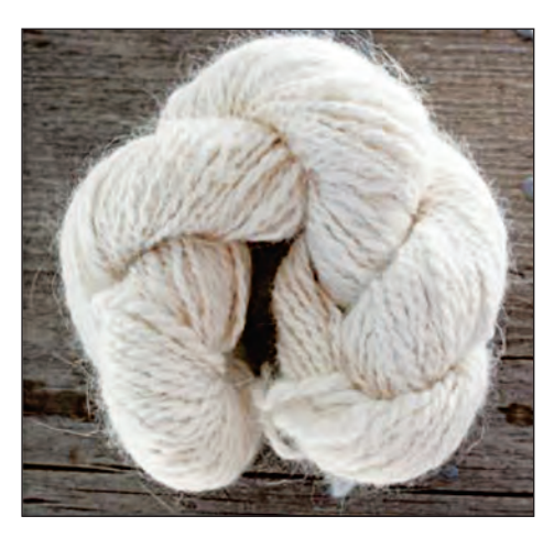
Pic. No. 3.2 Angora Wool