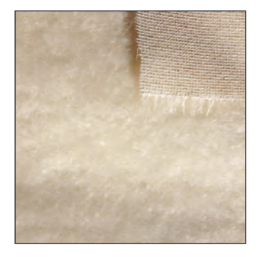
Pic. No. 3.4 Mohair fabric