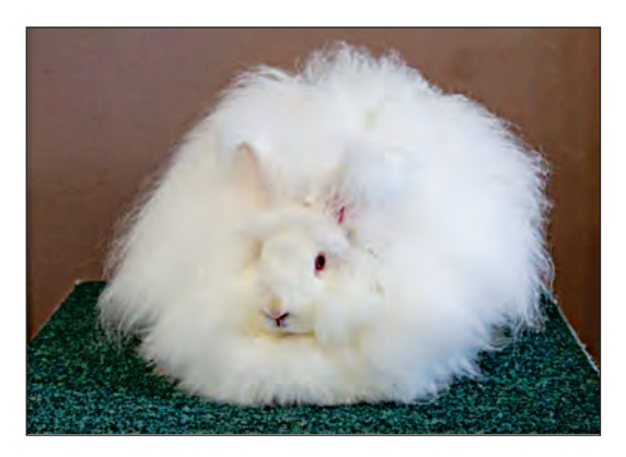
Pic. No. 3.1 Angora Rabbit

Europe has raised Angora rabbits for their fibre for centuries and French people made it popular.