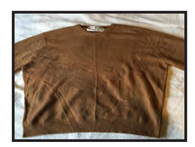
Pic. No. 3.8 Vicuna sweater