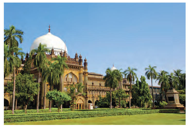
Chhatrapti Shivaji Maharaj Vastusangrahalay

The building of the museum is built in Indo-Gothic style. It has been given the status of Grade I Heritage Building in Mumbai. The museum houses about 50 thousand antiquities divided into three categories, Arts, Archaeology and Natural History.