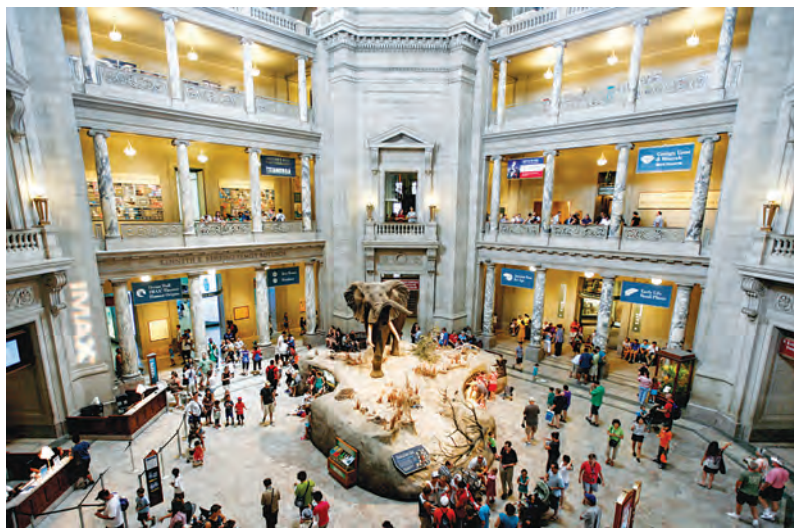
National Museum of Natural History

National Museum of natural History, United States of America : This museum of natural history managed by the Smithsonian Institution was established in 1846 C.E. It houses more than 12 crore (120 millions) specimens of fossils and remains of plants and animals, minerals, rocks, human fossils and artefacts.