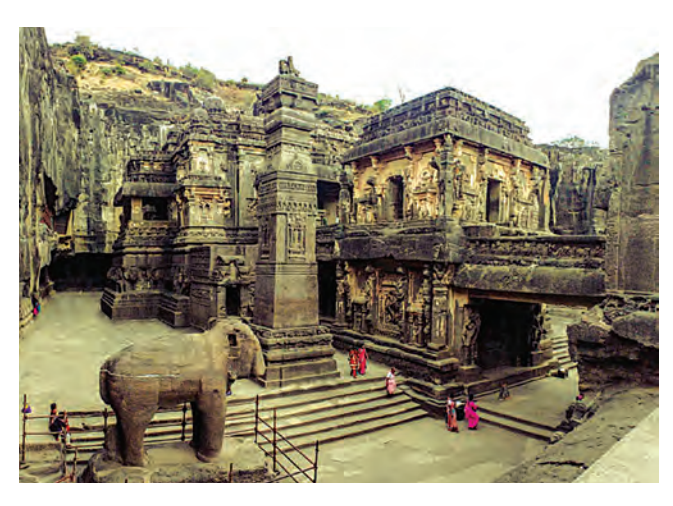
Kailasa Temple, Verul

'Cultural and Natural Heritage Management' is one of the main aspects of applied history. The work conservation and preservation of the Heritage falls under Cultural the jurisdiction of the Archaeological Survey of India and India's State Departments of Archaeology. Beside, INTACH (Indian National Trust for Art and Cultural Heritage) is actively working in this field. The work of conservation and preservation of cultural and natural heritage requires participation of experts from various fields. They need to be duly aware of the cultural, social and political histories of the heritage site. Principles of applied history are useful in creating the awareness among them. Thus,