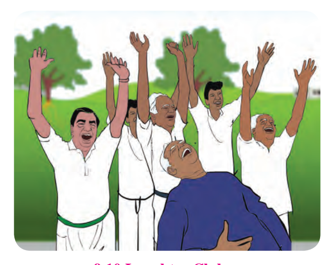
9.10 Laughter Club

Fostering the hobbies like material collection, photography, reading, cooking,