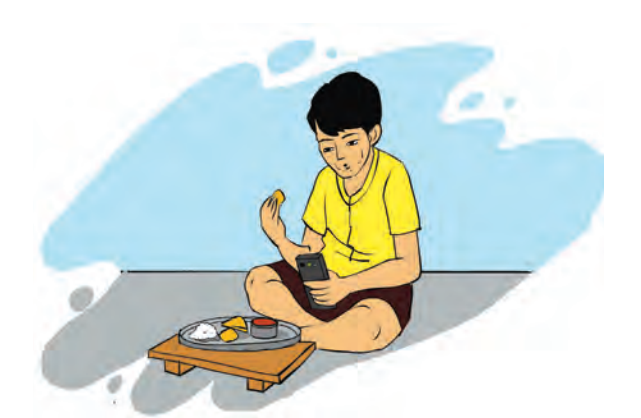
9.6 Boy using cell phone while eating