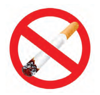
9.3 Addiction control