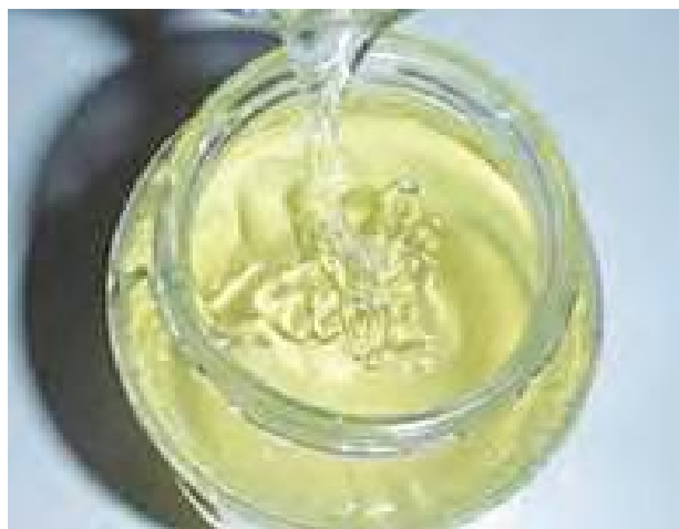
Fig. 5.15 Corn syrup

It is purified concentrated aqueous solution which is made from starch of corn. It is also known as glucose syrup to confectioners. It is used to soften texture, add volume and enhance flavour.