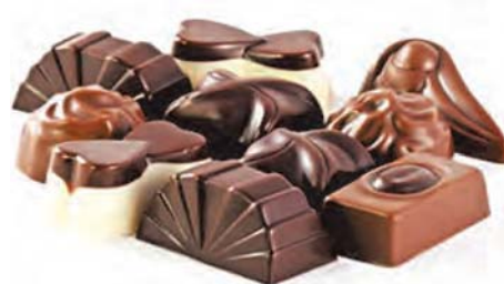
Fig. 5.11 Chocolate

Chocolate is prepared by roasted and ground cacao seeds which are further converted into powder, liquid paste and block etc. Several types of chocolate based confectionery products are prepared worldwide such as milk, white and dark chocolate etc. It is also used as a