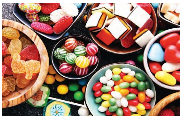
Fig. 5.1 Confectionery products

The Indian confectionery market is changing rapidly in terms of trends and consumer behavior pattern. Various multinational companies have entered in the Indian confectionery market by launching new products at affordable prices, wide varieties and addressing the nutritional concern. This has led towards an increased per capita consumption at about 2.3 kg in 2019.