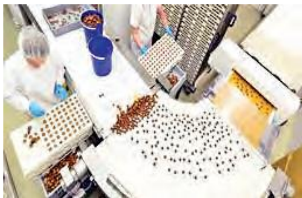
Fig. 5.2 Confectionery industry