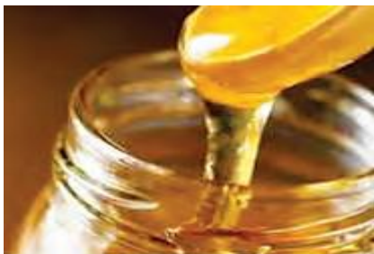
Fig. 5.14 Invert syrup

Invert sugar syrup can be prepared by heating sucrose (sugar) and water together by adding edible acid (citric/tartaric/acetic/lemon juice) or an enzyme (invertase) upto thick consistency.