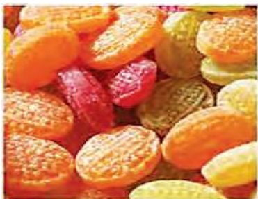
Fig. 5.7 Hard boiled candy

A hard candy, or boiled sweet, is a candy prepared from sugar and liquid glucose boiled to a temperature of about 149-166°C or to the hard-crack stage. After the syrup boiled to this temperature, then it is cooled to form a solid mass containing less than 2 percent moisture. It becomes stiff and brittle as it reaches to room temperature. Within this group a wide variety of products with different colours, flavours and shapes can be get developed. E.g. lollipops, lemon drops, peppermint drops and disks, rock candy, etc.