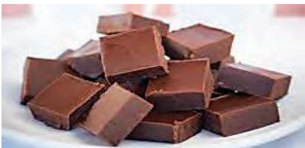
Fig. 5.6 Fudge

Fudge is made by boiling milk, butter and sugar at about 116°C so as to get a soft-ball consistency stage. While cooling the mixture, crystallization of sugar gives a coarse grain to the product. It is also prepared in chocolate flavour by adding 5 to 8 percent of cocoa syrup.