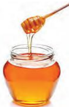
Fig. 5.16 Honey

Honey is natural invert sugar. It is rich in fructose and is used in developing low calorie confections. It contributes to the sweet taste and delicate flavour.