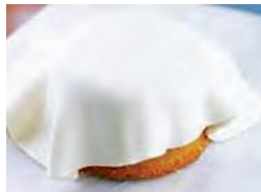
Fig. 5.10 Sugar fondant

Fondant is made by boiling a sugar solution with the optional addition of glucose syrup. The mixture is boiled to a temperature in the range of 116-121°C, cooled, and then beaten in order to control the crystallization process and reduce the size of the crystals. Creams are fondants which have been diluted with a weak