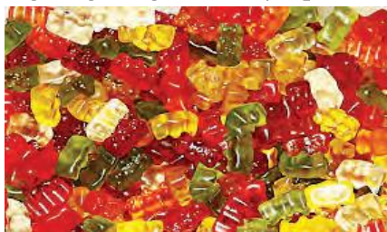
Fig. 5.9 Gelatinized sweets

This group contains the products from hard gum to soft jellies. They are prepared by combining sugar, glucose syrup and gelling