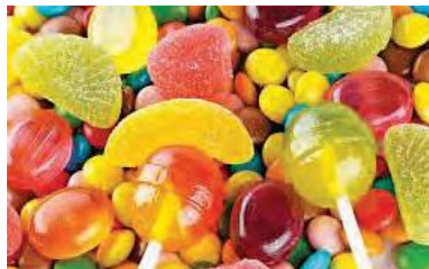
Fig. 5.3 Sugar confectionery

These are the confectionery products mainly made up of sugar added with flavourings and additives. E.g. candy, chocolate, sweet, toffee, etc.