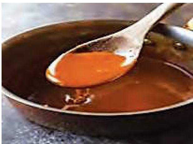
Fig. 5.4 Caramel

Caramels are derived from a mixture of sucrose, glucose syrup, and milk solids. The mixture does not crystallize, thus remains tacky. Caramels are of three types on the basis of temperature of process such as soft (118 to 120°C), medium (121 to 124°C) and hard (128 to 132°C).