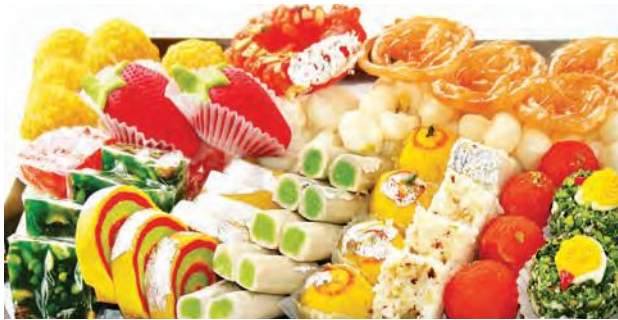
Fig. 5.12 Mithai

Mithai is a generic term for confectionery in India. It is typically made from dairy products and/or some form of flour. Sugar or molasses are used as sweeteners.