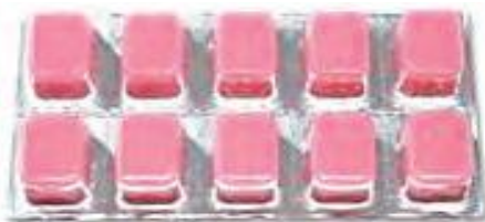
Fig. 5.8 Chews

Taffy or chews are a type of candy that is made by stretching and folding a sticky product for many times. The sticky product is prepared