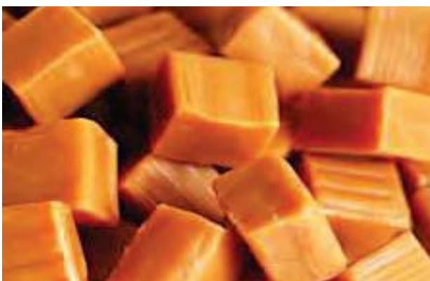
Fig. 5.5 Toffee

Toffee is made by heating process of sugar/jaggery with butter and milk solids. Toffees have lower moisture content than caramels and consequently have a harder texture. The use of fat and milk solid is less than the caramel. The final temperature reaches to about 152°C.