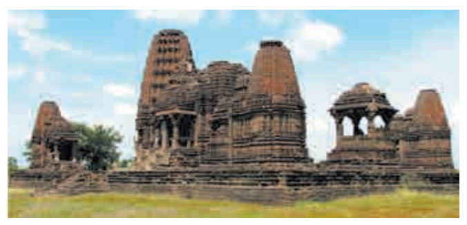
Gondeshwar Temple at Sinnar

'Lilacharitra' written by Mhamimbhatta of the Mahanubhava sect, 'Viveksindhu' by Mukundarai. 'Bhavarthdipika' Dnyaneshwar belong to this period. Similarly the composition of saint poets like Namadeva, Janabai, Chokhoba of the Varakari sect composed poems, which are known as 'Abhangas'. Many temples were built in this period. They are generally referred to as 'Hemadpanti' temples. The Gondeshwar temple at Sinnar and the temple complex at Anjaneri are the finest example among the temples built during this period. An important feature of the Hemadpanti temples is that no mortar is used. Instead the stones are interlocked with the help of mortise and tenon. During this period, the crucial forts of Ankai and Tankai were constructed.