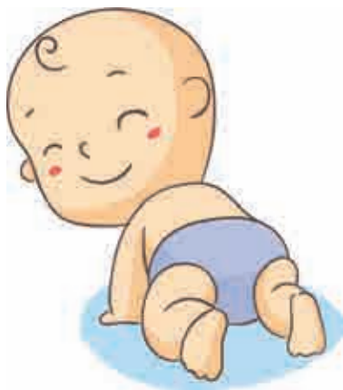
Fig. 4.2 Infant

This stage ranges between 2 week after birth to 2 years. During this stage rapid physical and motor development takes place. Within 2 months child can turn his head. Child can sit and walk with support by 9 months. Child starts walking independently by around 12th months of age.