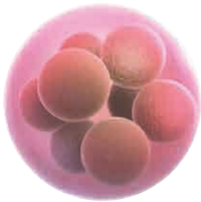
Fig. 4.1 Embryo

At this point, the mass of cells is known as an embryo. This period starts from the third week after conception and continues till the 9th week. It is a time when the mass of cells becomes distinct as a human. The embryonic stage plays an important role in the development of the brain. Almost all the internal as well as external organs are developed by the end of this period.