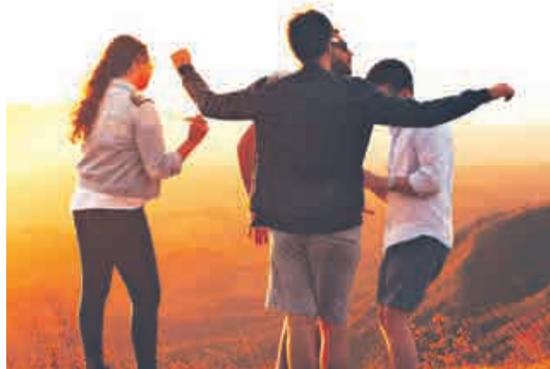
Fig. 4.4 Adolescents in a group