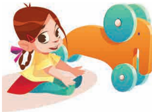
Fig. 4.3 Child in nursery

This stage extends from 2 years to about 6 years. This age is also called preschool age. Child develops control over his muscles. Child becomes physically independent. The physical territory of the child increases, so automatically child learns about social behaviour. Child asks number of questions to others. Hence this age is called as ‘questioning age’ or the ‘age of curiosity’.