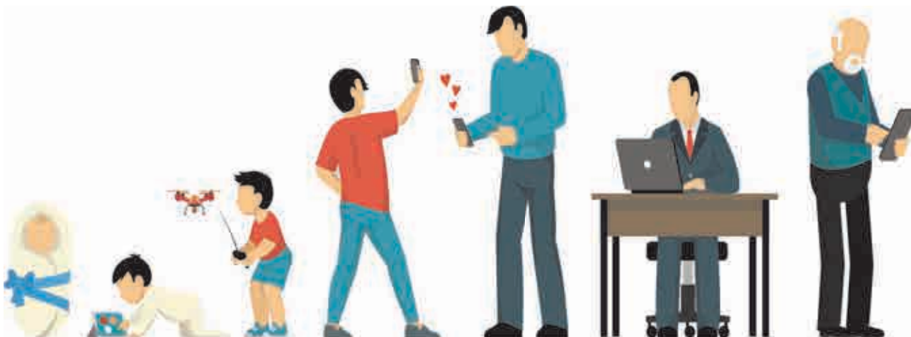
Fig. 4.5 Life span : from infancy to old age