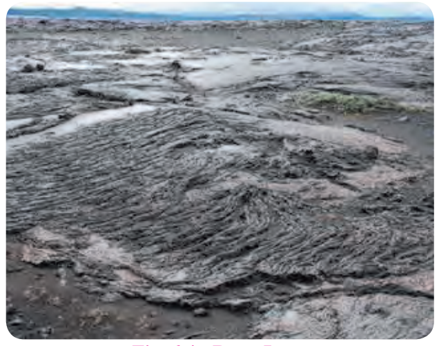
Fig. 6.4 : Ropy Lava

accessory amount of biotite and hornblende. Olivine may or may not be present. It shows compact, vesicular, amygdaloidal, pipe amygdaloidal, pillow and columnar structure. The cavities in vesicular basalts are filled with secondary minerals like heulandite stilbite, apophyllite, quartz, amethyst, chalcedony, agate, jasper, opal, calcite etc. Ropy lava structure, columnar joints are commonly observed in basalts (Fig.6.4 and 6.5).