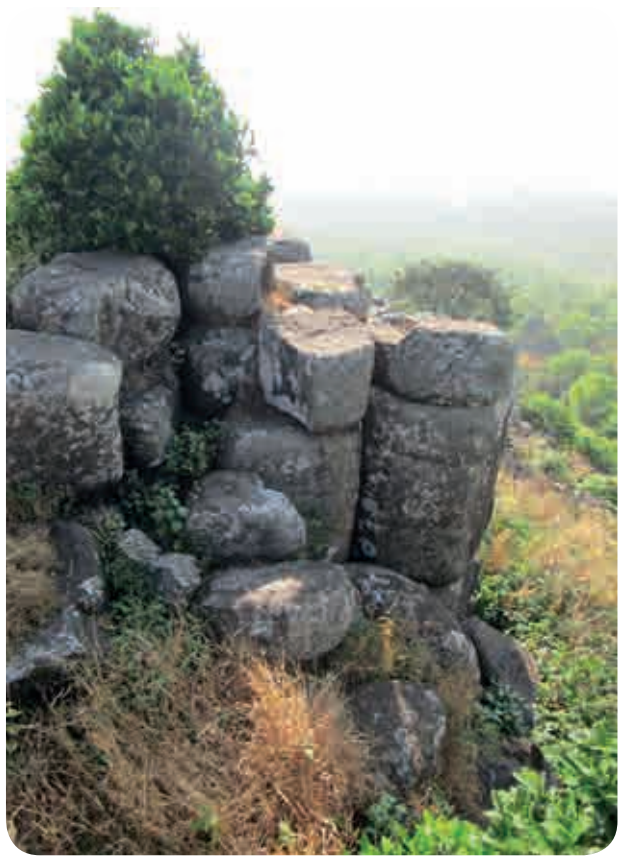
Fig. 6.5 : Columnar joints, Tumzai Hills, Panhala