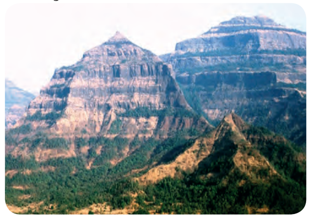
Fig. 6.3 : Stratigraphic exposures of lava flows in Malshej Ghat area of Maharashtra

districts in Vidarbha region and Ratnagiri and Sindhudurg districts in coastal Konkan. Two types of lava flows are recognized. They are the pahoehoe or ropy lava and the 'aa' or blocky lava. Pahoehoe lava flows predominate in Dhule, Aurangabad, Pune and Nasik districts, whereas in rest of Maharashtra, 'aa' lava flows are dominantly exposed. In Maharashtra between some flows intertrappean beds of lacustrine origin are found. Red bole beds commonly occur in between two lava flows. The flows are intruded by number of dolerite dykes trending nearly N-S, parallel to the west coast. East-west trending dykes are commonly exposed in northern part of Maharashtra around Nandurbar, Dhule and Jalgaon districts.