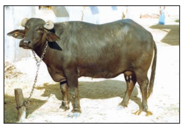
Fig. 3.4 b Mehsana : Female