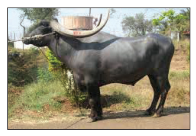
Fig. 3.7 a Pandharpuri: Male