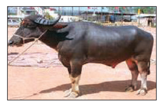
Fig. 3.3 a Surti : Male

3. A characteristic feature is the presence of two white collars (chevrons); one around jaw from ear to ear and the other on brisket. There may be a streak of white hair above the eyes. The region below the knees and hocks has a whitish or grey tuft of hair