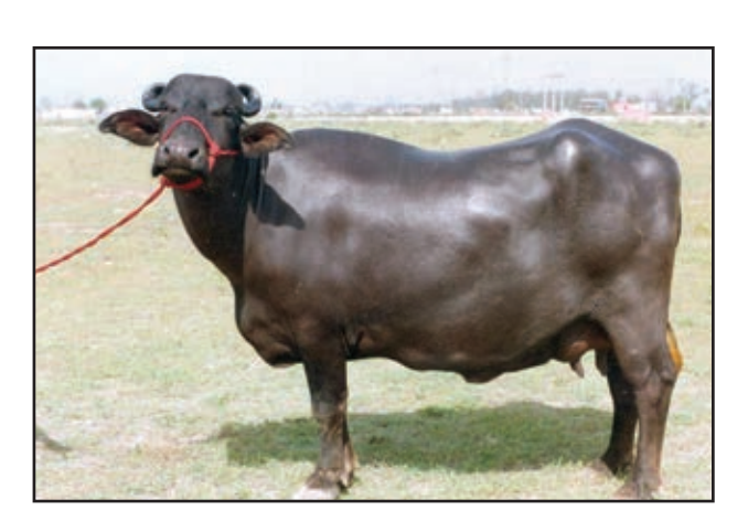
Fig. 3.2 b Murrah: Female