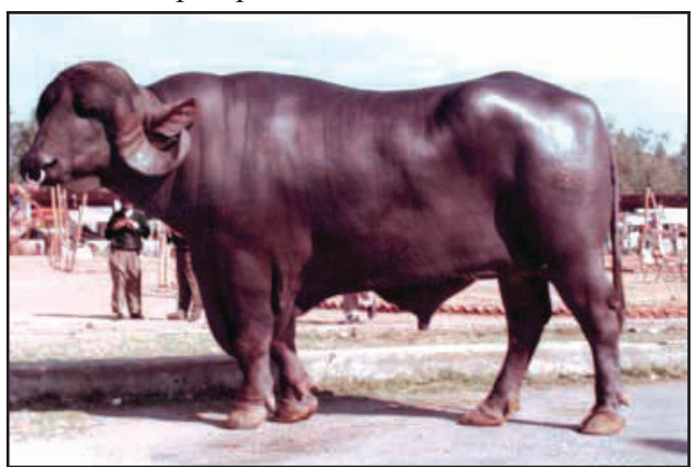
Fig. 3.5 a Jaffarabadi : Male