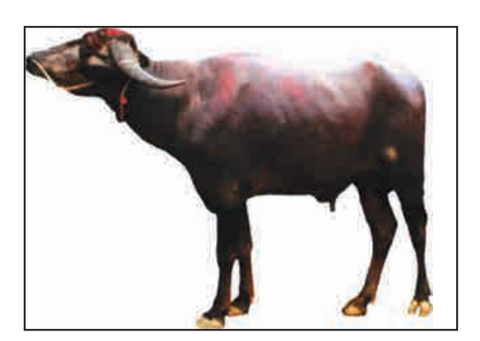
Fig. 3.8 a Marathwadi : Male