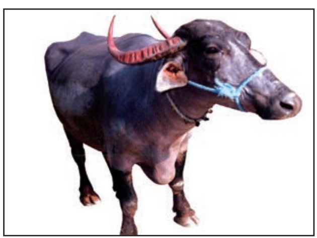
Fig. 3.8 b Marathwadi: Female