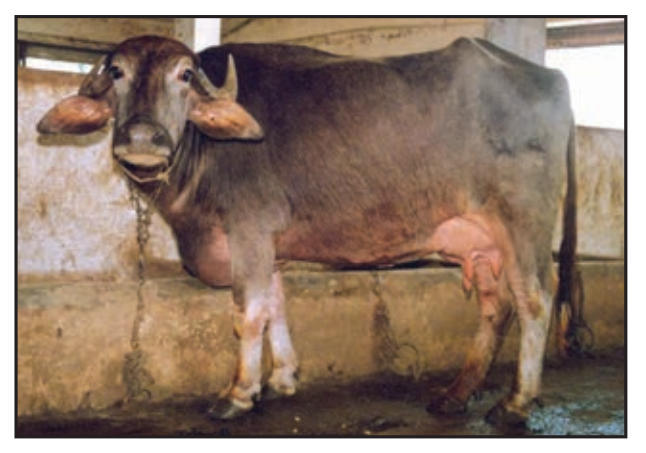
Fig. 3.3 b Surti: Female