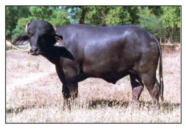
Fig. 3.4 a Mehsana: Male

1. Mehsana animals are intermediate between Murrah and Surti.