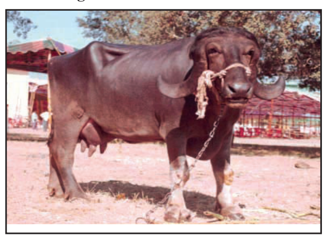
Fig. 3.5 b Jaffarabadi : Female