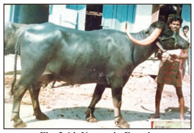
Fig. 3.6 b Nagpuri : Female