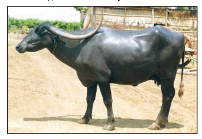
Fig. 3.7 b Pandharpuri : Female