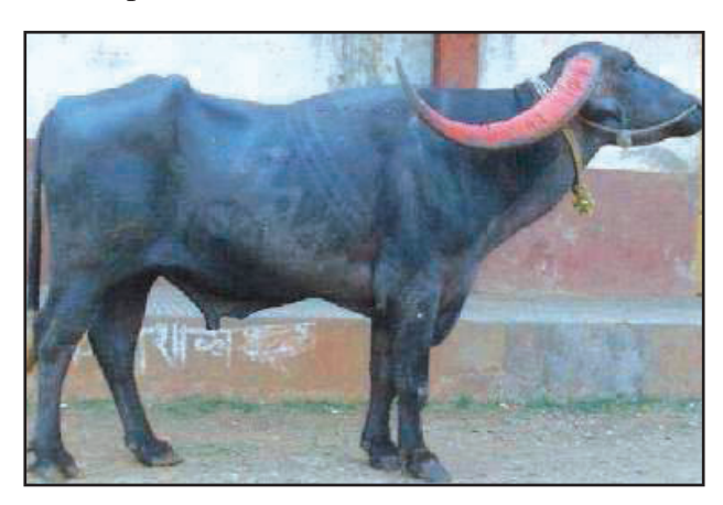
Fig. 3.6 a Nagpuri: Male