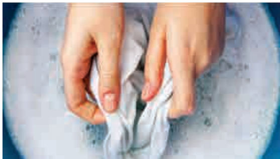
Fig 7.1 Hand Friction

A. Hand Friction – This method is useful when small clothes like handkerchiefs or baby clothes are to be washed. Clothes are steeped in soap solution and then rubbed by hand to clean them ( see picture. No.7.1). This method does not put much strain on the clothes but it is not suitable in case of bigger clothes or heavily soiled clothes.