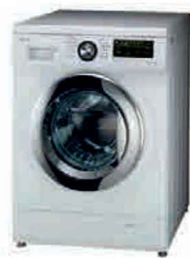
Picture. No. 7.7 Fully-automatic Washing Machine