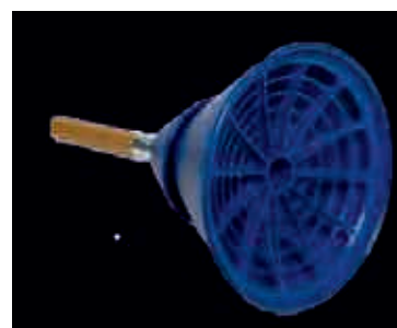
Picture. No. 7.5 Suction Washer