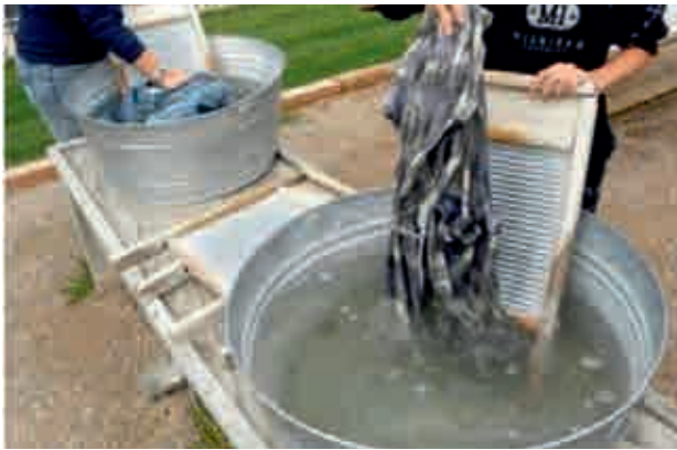
Picture. No. 7.3 Scrubbing Board