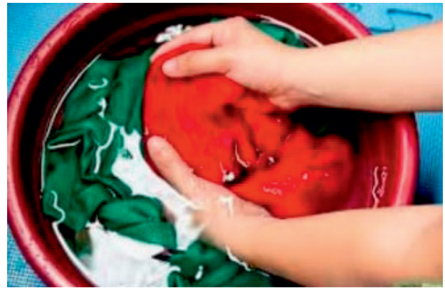
Picture. No. 7.4 Kneading and Squeezing Method