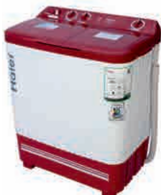
Picture. No. 7.6 Semi-automatic Washing Machine