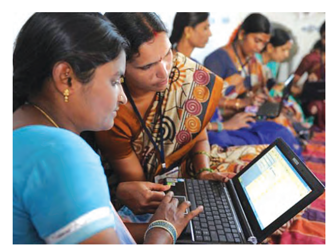
Women Empowerment in India

The socio-cultural landscape for women is a complex mixture of the old and the new. Industrialisation, globalisation, urbanisation, and modernisation have led to major changes in the lifestyle of women. On the one hand, liberalisation has provided better opportunities for women in terms of education, jobs, and decision-making power. On the other hand, increased violence, wage differences and discrimination continue. Change in social norms and mindsets can be brought through institutional initiatives. This involves the family, community, religious and educational institutions. It can initiate, strengthen, and implement economic and social policies for gender equality.