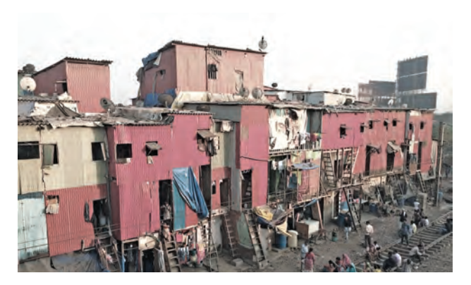
Poverty in India: Urban India

There is an alternate view of poverty. This focuses on both the material and non-material aspects of life. Here the focus is on human wellbeing through sustainable societies in social, economic and political terms. Here the emphasis is on values, community ties and availability of common resources. Such a view would focus on participatory nature of decision making, ensuring that the marginalised community is able to participate in public policy and promote economic and political decentralisation.