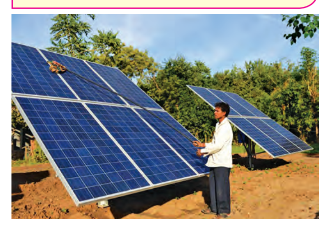
Solar panels - Non-Conventional Energy Source

What are the different initiatives taken by the Indian Government to protect the environment?