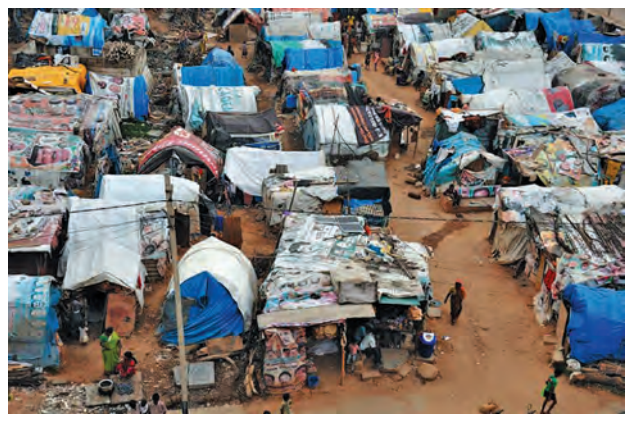
Poverty in India: Migration

The approach to the concept of development is usually looked at through a set of social and political values. The purpose of development is to ensure welfare of the people. For example, development can be associated with economic growth. One perspective about economic growth can focus on the predominant role of the State in