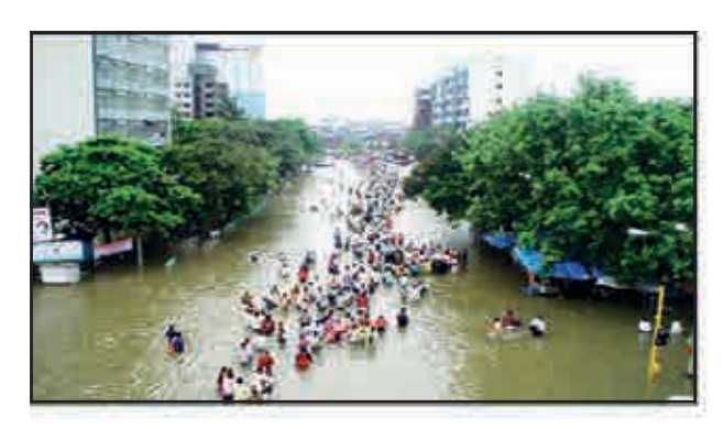
Figure 5.5 : July 26, 2005, Mumbai flood

Major cities in India have witnessed loss of life and property, disruption in transport and power and incidence of epidemics. Therefore, management of urban flooding has to be accorded top priority. Increasing trend of urban flooding is a universal phenomenon and poses a great challenge to urban planners the world over. Problems associated with urban floods range from relatively localized incidents to major incidents, resulting in cities being inundated from hours to several days.