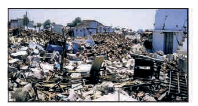
Figure 5.2 :The Bhuj earthquake 26th January,2001

Earthquakes in Maharashtra show major alignment along the west coast and Western Ghats region. Seismic activity can be seen near Ratnagiri, along the western coast, Koyna Nagar and Thane district.