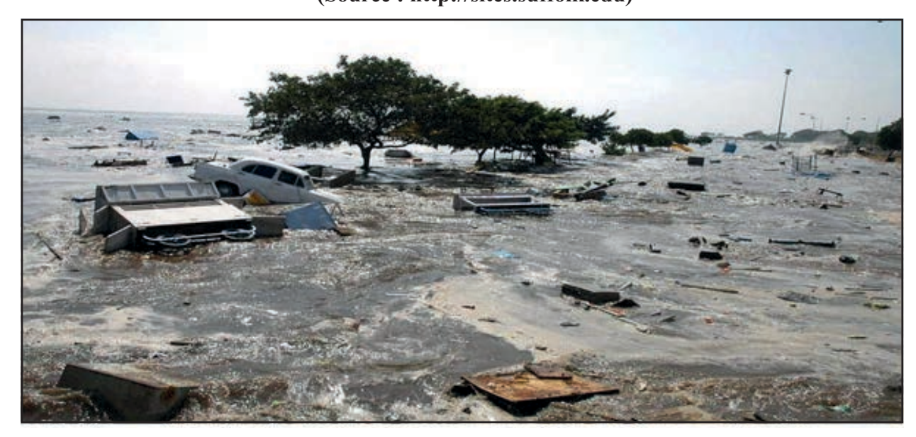
Figure 5.7: A general view of the scene of Marina beach in Chennai, India, On December 26, 2004, after tsunami wave hit the region. Waves devastated the southern Indian coasttime killing an estimated 18,000 People.