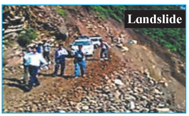
Figure 5.1: Examples of Natural disasters