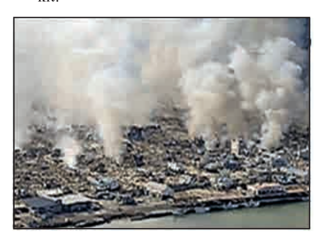
Figure 5.6 : Japan Tsunami Fukushima Daichi Nuclear disaster , 14 <sup>th</sup> March,2011