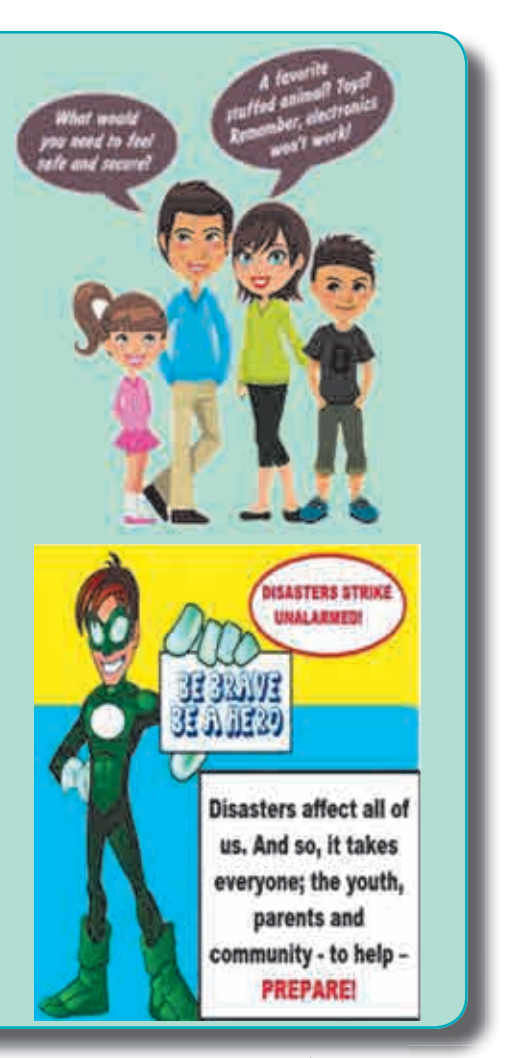
Figure 5.10: The Disaster Emergency Kit