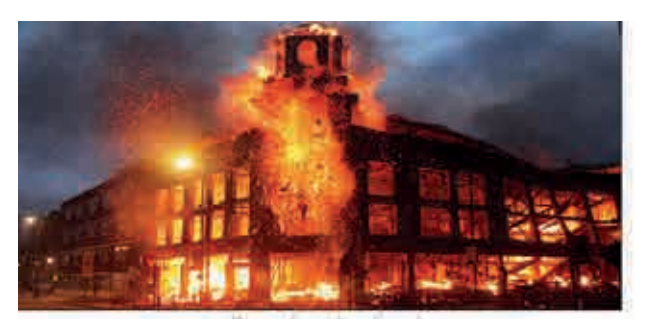
Figure 5.8: Fire Incident

Fires can spread rapidally and have a very serious effect on our lives, homes, and families. It is very important that everyone in your family is aware of proper fire protection.