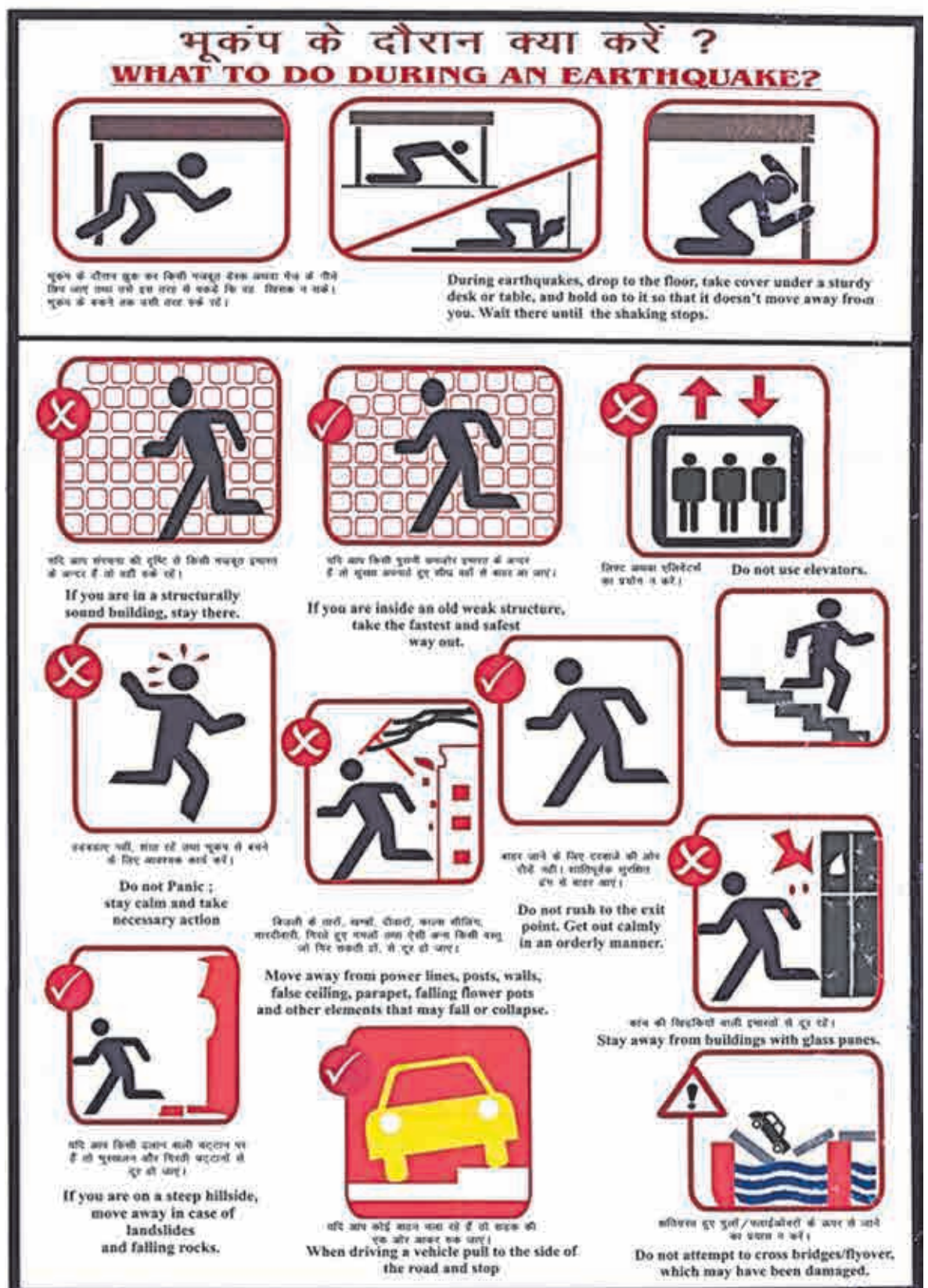
Figure 5.4 : What to do during an earthquake