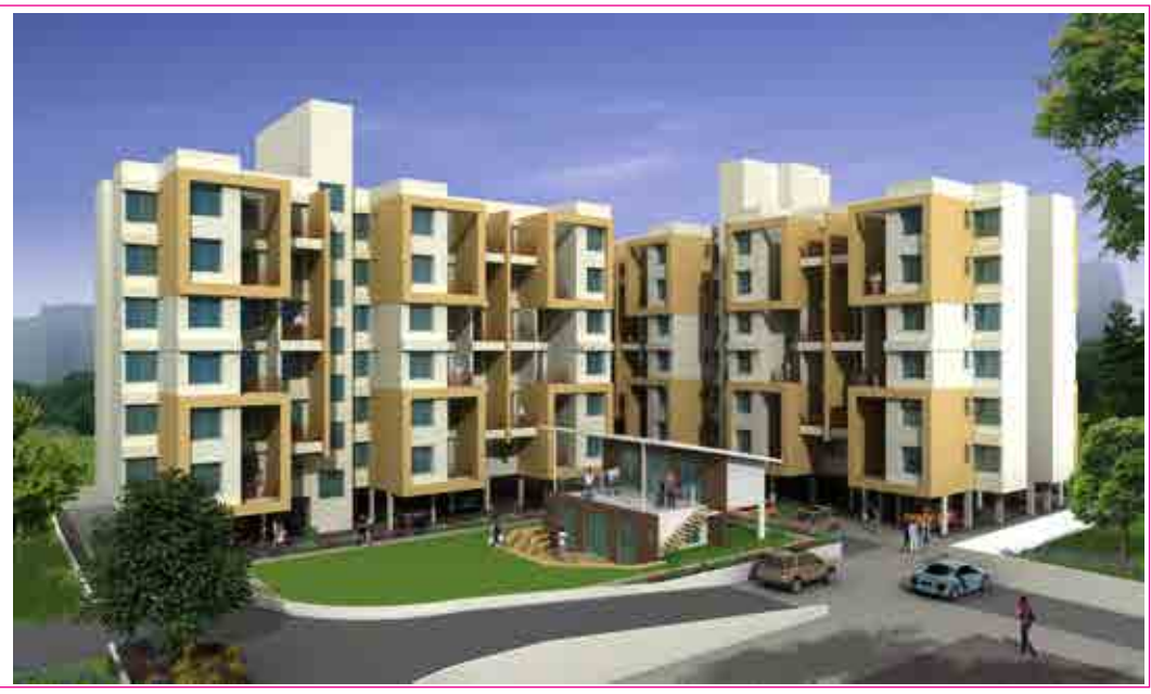
Housing Co-operative Society