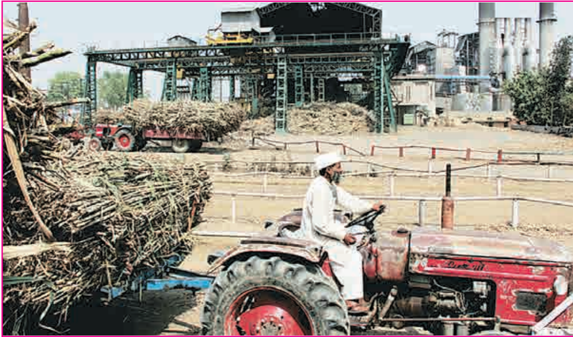
Co-operative Sugar Factory

the co-operative sector is carried out by the Board of Directors in democratic manner. The Government also provides capital to the sugar factories in form of share capital. Industrial Economic Development Corporation provides long term loan up to 60% of the expenditure. Central and state government undertakes 50-50% guarantee for loan. Majority of the sugar factories are in Maharashtra.