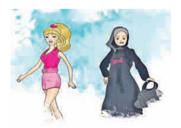
Hybrid version of Barbie