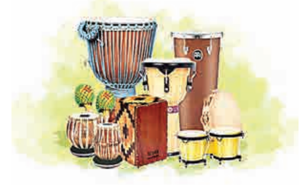
Examples of material culture

Non-material culture: Non-material culture refers to the ideas created by human beings. The nature of non-material culture is abstract and intangible. For e.g. norms, regulations, values, signs and symbols, knowledge, beliefs etc. Non- material culture is further divided into cognitive and normative aspects of culture. The cognitive aspects refer to understanding as well as, how we make sense of all the information around 118. e.g. ideas knowledge, beliefs. The normative aspects consist of folkways, mores, customs, conventions and laws. These are mainly values or rules that guide social behaviour.