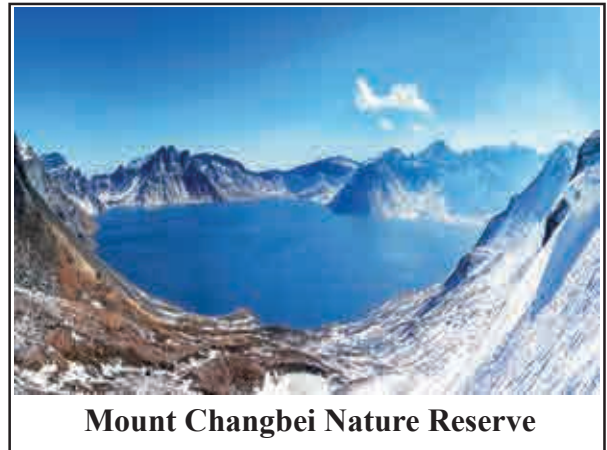
Mount Changbei Nature Reserve

Jilin, along with Heilongjiang and Liaoning, was one of the three provinces that made up what was formerly called Manchuria and what is now referred to as China’s northeast (Dongbei). Jilin borders Russia to the east, North Korea to the southeast.