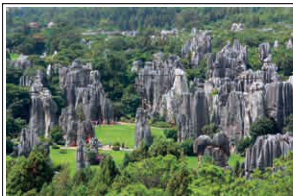
Limestone Forest, UNESCO World Heritage Site

It is a province of the People’s Republic of China. It is located in Southwest China. Tiger leaping Gorge was named a UNESCO World Heritage Natural Site.