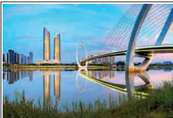
City Skyline and Modern Buildings, Nanjing

Jiangsu is coastal Chinese province and the richest among other provinces in China. The capital city of the province is Nanjing, located roughly in the centre of the province. The name Nanjing means ‘Southern Capital’ and the city has been the capital of China on several occasions throughout history.