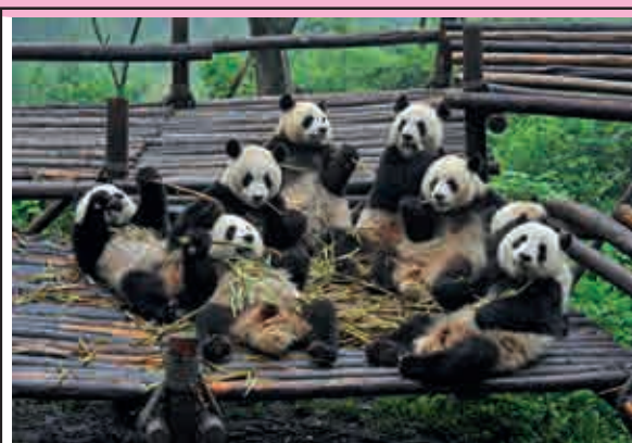
Panda Breeding Center

Sichuan Province is one of the largest province in China. It is located in the upper Yangtze River (Chang Jiang) valley in the southwestern part of the country.