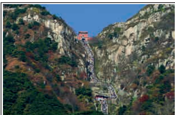
Nantian Men, Tai Shan

It is a coastal province of the People’s Republic of China, and is part of the East China region. The name Shandong, which means “East of Mountains”.