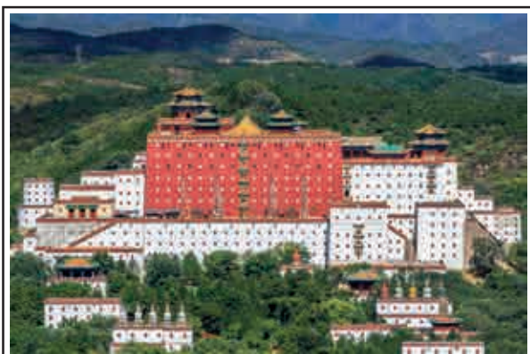
Pu Tuo Zongcheang Temple

Hebei province has 278 historic sites under national protection, ranking foremost in the country. The Great Wall of China starts from this province. The major cities, Beijing and Tianjin are surrounded by Hebei.