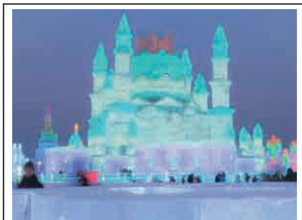
Harbin International Ice and Sculpture Festival

Heilongjiang is China's northernmost province. It is bounded by Russia to the north and east, by Jilin to the south, and by the Inner Mongolia Autonomous Region to the west. Its name comes from the Heilong Jiang – Black Dragon River. Heilongjiang contains China's northernmost and easternmost points.