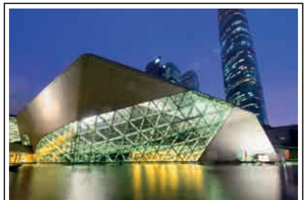
Guangzhou Opera House

Guangdong was formerly known as Canton. It was the starting point of Maritime Silk Road. It is now the third richest province in China.