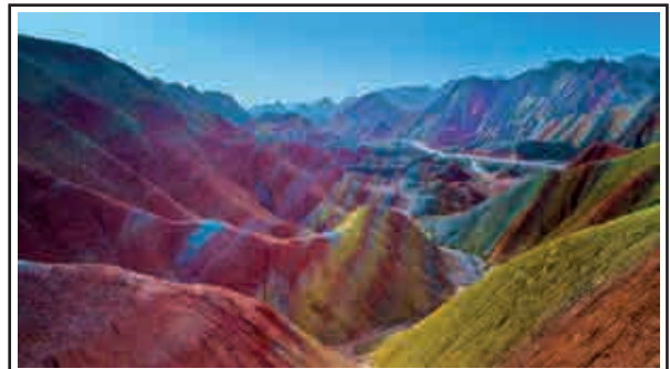
Zhangye Rainbow Mountain

Gansu province was the region through which thick traditional Silk route passed. It provided the passage for goods, cultures and ideas to connect China with Central Asia.