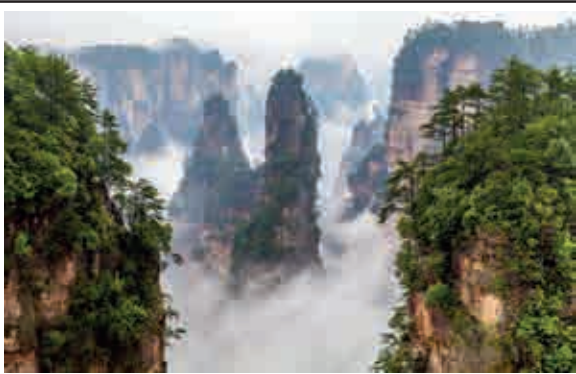
Hallelujah Mountains (Avatar Movie)

throughout China for being both delicious and incredibly spicy. Zhangjiajie national park is situated in this province, which has sandstone peaks. Souther Sky Column, one of the peaks had been officially renamed “Avatar Hallelujah Mountain” in honor of the movie Avatar. According to park officials, photographs from Zhangjiajie inspired the floating Hallelujah Mountains seen in the film.