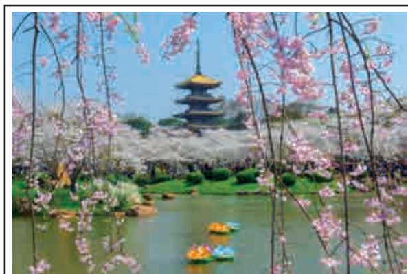
Sakura Garden, Wuhan

Hubei is slightly larger than Syria. Its name means 'North of the Lake' referring to its location north of Dongting Lake as compared to Hunan which means 'South of the Lake'.