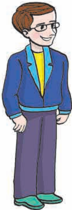
Mik British 马克 mǎkè