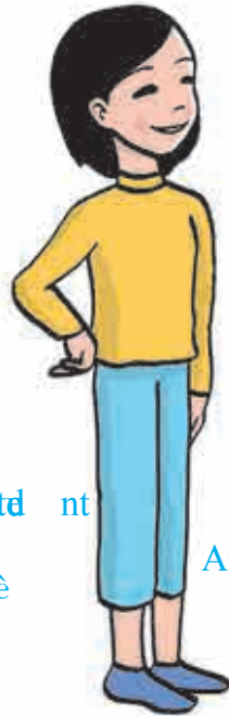
Linya Chinese Stđ nt 林月 lín yuè