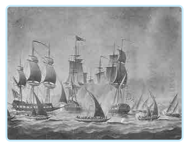
Maratha Ships attacking British Ships

Another important development during the Maratha rule was the awareness of maritime security. The naval strength developed during Chatrapati Shivaji Maharaj's period and the role played by