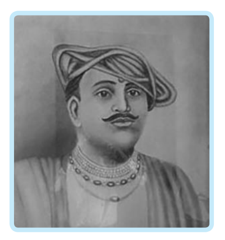
Sarkhel Kanhoji Angre

the Angres along the Konkan coastline was of critical importance. They were able to check the Portuguese, French and the British expansion in this region.