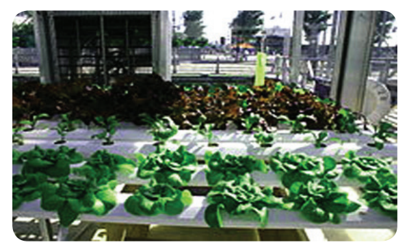
Fig. 3.5: The nutrient film technique being used to grow various salad greens