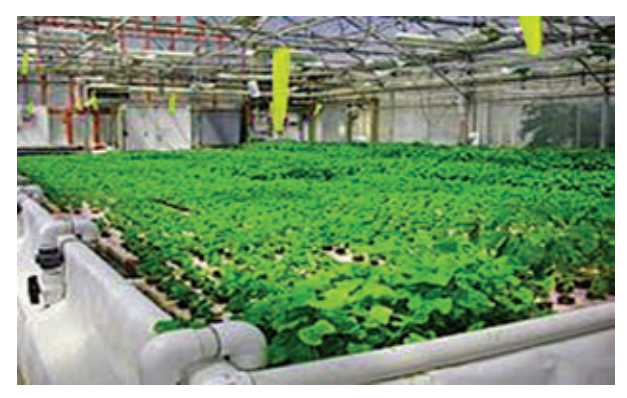
Fig 3.4: Static solution culture

In static solution culture, media solution is stable in the container. Particular level is maintained to keep some of the roots exposed in air for availability of oxygen or the solution may be aerated by using aquarium aeration pump system. When concentration of nutrients in the solution is decreased, new solution is added or previous one is replaced periodically. Static solution hydroponic method is generally followed for home scale or small units.