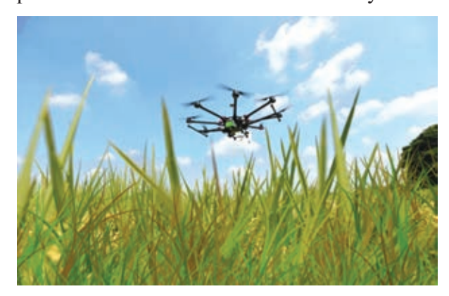
Fig 3.1 : Use of drone for spraying operation

Foliar application of inputs like pesticides, fertilizers, growth regulators, weedicides, etc. is not only expensive but also full of risk for the operators. Restrictions in spraying due to wet soil, densely populated crops like sugarcane, can be overcome by the use of drones. Drones may be operated by remote control or by programming with GPS parameters. It is going to be a new opportunity of employment to provide drones on rent or contractual system.