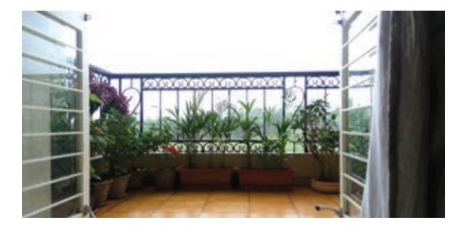
Fig 3.2 : Terrace garden

Because of crowding, pollution and hectic lifestyle, urban people are always in search of a hobby which can give scope for their creativeness and feel pleasure. Most of them have affection towards agriculture. But they have no agricultural land or other facilities. Novel concept of vertical gardening allows such people to grow flowers, vegetables and fruits also in their balconies, terrace, common places, etc. Use of cocopeat, hydroponics and aeroponic technologies are also adopted in urban agriculture. Municipal corporations, railway, corporate buildings, apartments, etc. are now covering their walls, pillars and terace by vegetation. Here cocopeat is used as media for growing, as it is light in weight and having higher water holding capacity. Vertical gardens are expensive as compared with ground-level gardens. It requires panels and framework, specially designed pots, irrigation system and maintenance.