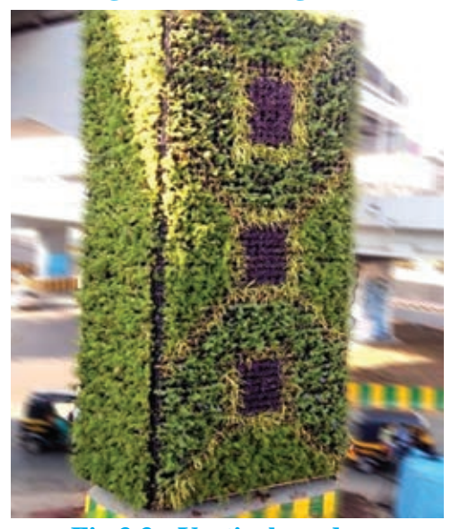
Fig 3.3: Vertical garden