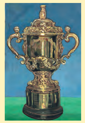
Wimbledon Men's Cup