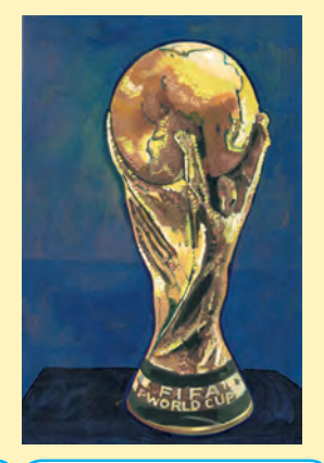
Football World Cup Wimbledon Women's Cup