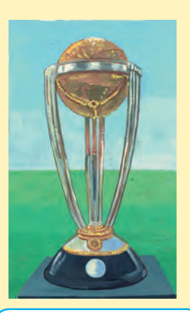
Cricket World Cup