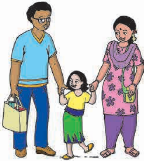
Fig. 6.4 : Small family