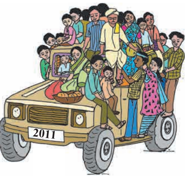
Fig. 6.3 : Population Explosion