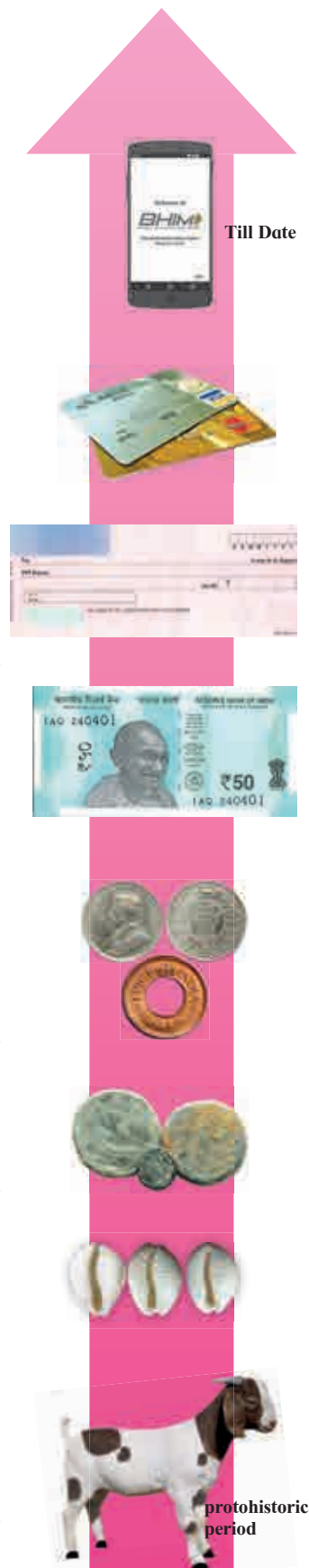
Fig. 2.2 : Evolution of Money