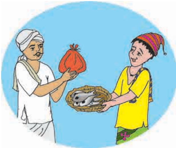
Fig. 2.1 : Barter system

Man is an intellectual animal. The invention of money is one of the important and fundamental inventions out of various inventions in the world. According to Crowther, there is a basic invention in each branch of knowledge, e.g. invention of fire in science, invention of wheels in mechanical science. The concept of money is an important concept which has brought about a revolutionary change in the economic life of human beings. Various goods and services are bought and sold with the help of money, to satisfy human wants. Modern economy is dependent on money. Money which is in circulation today was created to reduce the difficulties in Barter System.