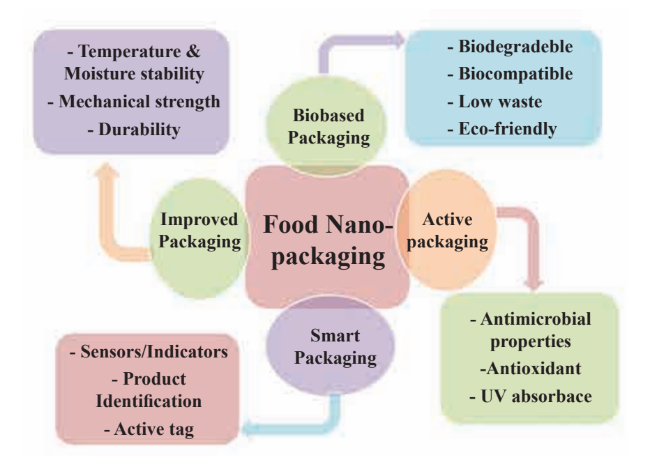
Fig. 15.3 Food nano-packaging classification and functions