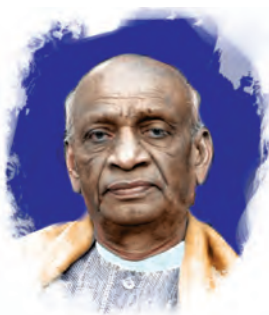
Sardar Vallabhbhai Patel

When India gained independence, there were more than 600 princely states of various size. Their political integration was the biggest challenge faced leaders the by of independent India. There