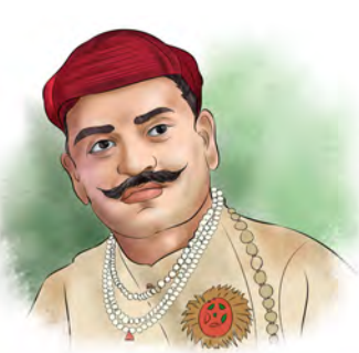
Maharaja Sayajirao Gaikwad

for the students from the untouchable-tribal class. He also encouraged women's education and also opened a centre for physical training women. He started various social programmes, such as,