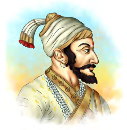
Chhatrapati Shivaji Maharaj

*The northern region of Goa was known as 'Bardesh'.