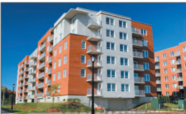
Flat / Apartment

C) Flat / Apartment : The simplest meaning of the term flat can be stated as; a self-contained housing unit occupying only a part of a building. In India, a building that has a number of flats is termed as an apartment building. It is an area in a building used by a family for living. This living area is divided into number of areas for the family members to carry out various activities comfortably like entertaining the guests, sitting together as a family group, taking care of personal needs, sleeping (taking rest), getting ready, studying, cooking, eating etc. Considering these needs, we find that a flat has a living room, bedroom, kitchen, study room, toilets etc. The family may go in for a one bed room, two room