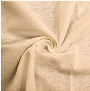
Pic. No. 3.11 : Flax Seed to Linen Fabric