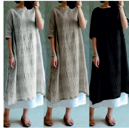
Pic. No. 3.12 : Apparel uses of Linen