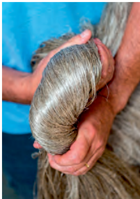
Fig. No. 3.1 : Flax Plant & Linen Fiber

The word flax is derived the old English Fleax. Linen is term applied to the yarn spun from the flax fibers and to the cloth or fabric woven from this yarn.