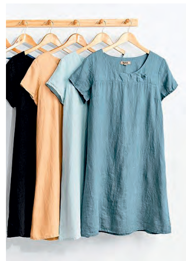
Pic No. 3.13 : Apparel uses of Linen