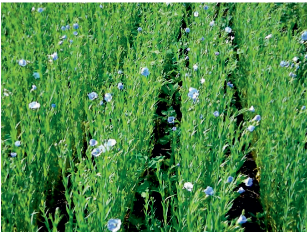
Pic. No. 3.2 : Cultivation of Flax