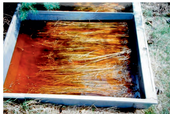
Pic. No. 3.8 : Tank retting