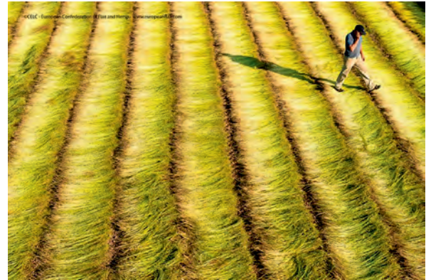
Pic. No. 3.7 : Dew Retting