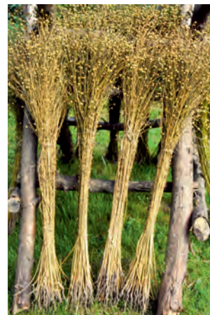
Pic. No. 3.6 : Drying Linen Stalk