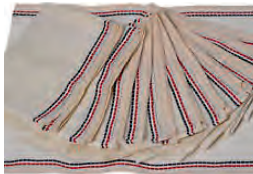
Pic. No. 3.14 : Household & Miscellaneous uses of Linen