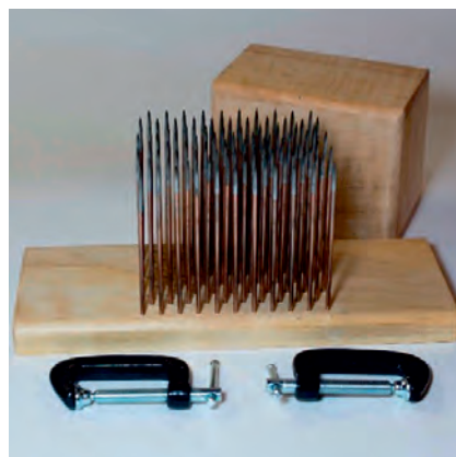
Pic. No. 3.10 : Hackling