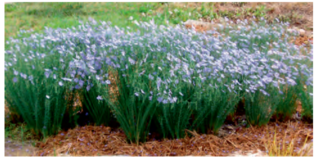
Pic. No. 3.3 : Flax Plant

Flax seed is planted by hand in April or May. The seeds are sown close together, so that the plant will grow dense but fine. The flax plant reaches a height of 2-4 feet. Its blossoms are delicate pale blue, white or pink. Plants are pulled before the seeds are ripe when it is to be used for fibers.