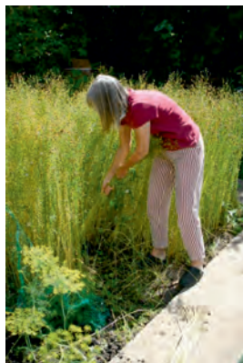
Pic. No. 3.5 : Pulling

By the end of August flax turns brownish in colour. It indicates that it is ready for pulling. At this stage if it is delayed, the fibers lose its prized luster and soft texture. Flax for fibers is pulled by hand or mechanical pullers, to keep the roots and stalk intact for the fibers extend below ground surface. The stalks are tied in bundles called beets.