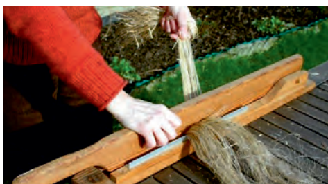
Pic. No. 3.9 : Scutching

Scutching process separates the outer covering or shives from the usable fibers. The flax fibers are thus released from the stalk. This process is done by hand or by machines.