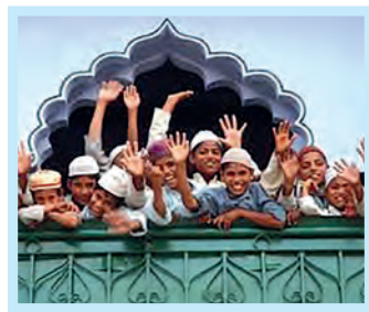
Unity in Diversity in India