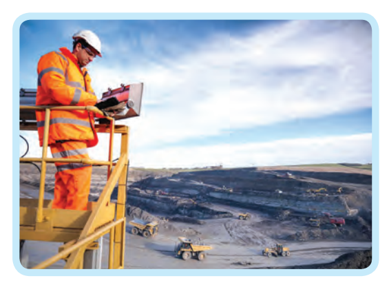
Elements of National Power