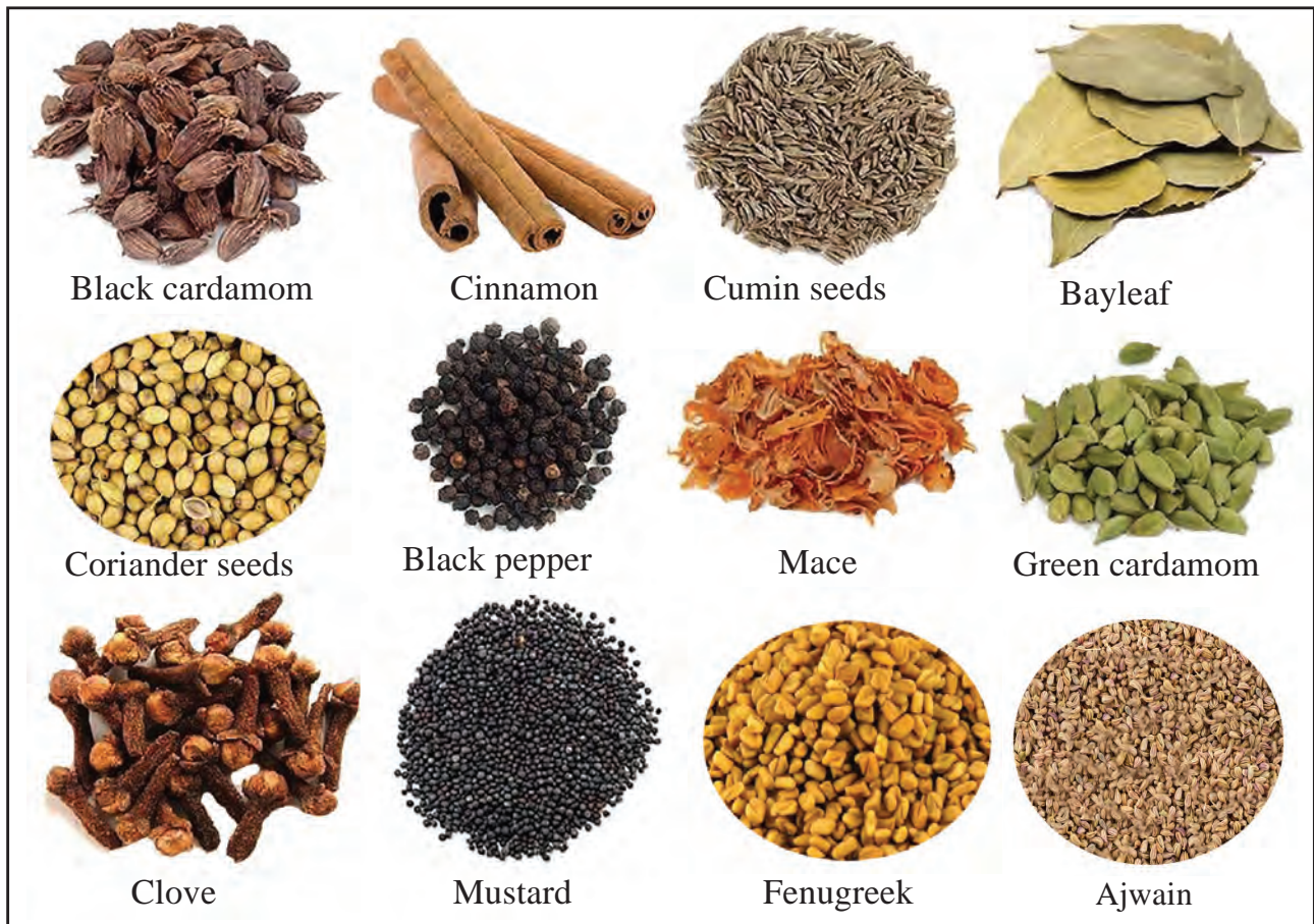
Fig.11.3 Whole spices