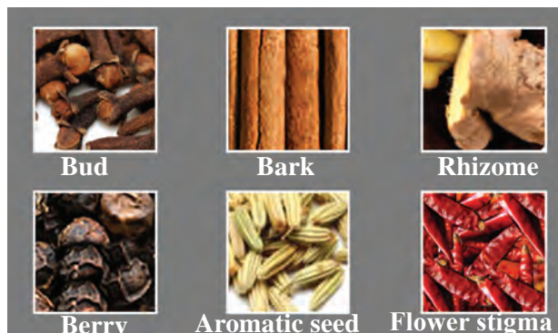
Fig. 11.2 Parts of plants used as spices

Definition : Spices and Condiments are those substances such as natural plants or vegetable products (any part of plant) or their mixture in whole or ground form, which impart flavour, aroma and pungency to the food preparation.