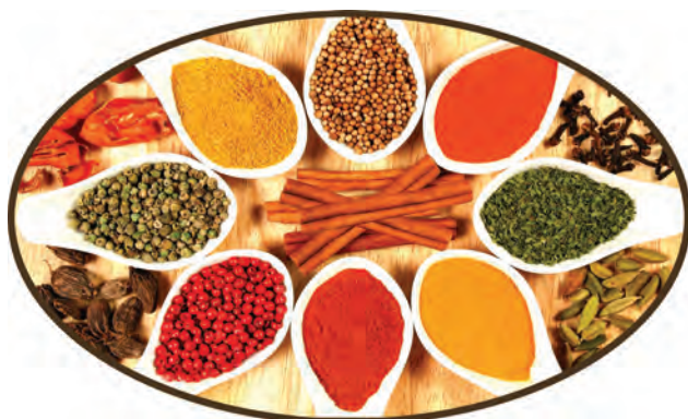
Fig. 11.1 Spices

In Indian diet spices and condiments play an important role. A well cooked garnished and nutritionally balanced diet without spices may not be acceptable, because of its insipidity. Same diet, if it is improved by adding various flavouring agents and spices will be highly appreciated by majority of the people. It will become more acceptable and palatable.