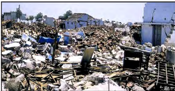
Figure 5.2 :The Bhuj earthquake 26 th January,2001

Earthquakes in Maharashtra show major alignment along the west coast and Western Ghats region. Seismic activity can be seen near Ratnagiri, along the western coast, Koyana Nagar and Thane district.