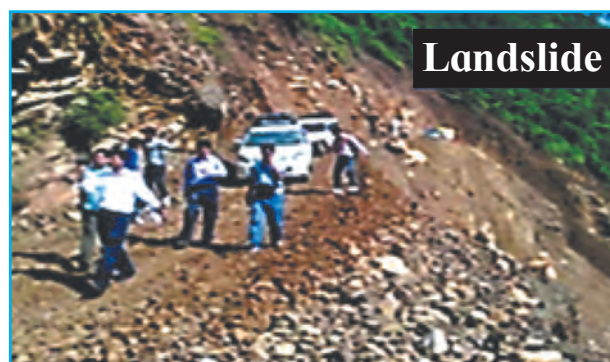
Figure 5.1 : Examples of Natural disasters