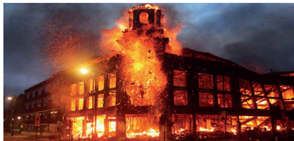
Figure 5.8 : Fire Incident

Fires can spread rapidly and have a very serious effect on our lives, homes, and families. It is very important that everyone in your family is aware of proper fire protection.