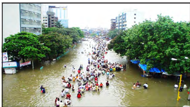
Figure 5.5 : July 26, 2005, Mumbai flood

Major cities in India have witnessed loss of life and property, disruption in transport and power and incidence of epidemics. Therefore, management of urban flooding has to be accorded top priority. Increasing trend of urban flooding is a universal phenomenon and poses a great challenge to urban planners the world over. Problems associated with urban floods range from relatively localized incidents to major incidents, resulting in cities being inundated from hours to several days.