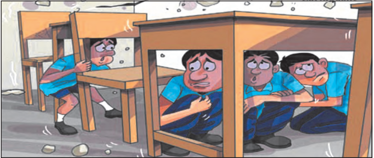
Figure 5.3 : 'DROP', 'COVER', 'HOLD ON' activity during earthquake