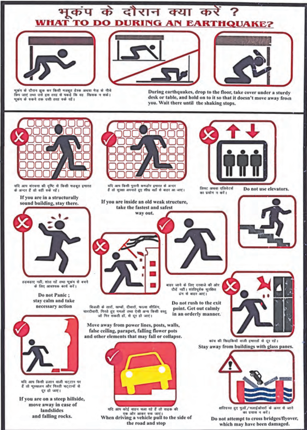
Figure 5.4 : What to do during an earthquake