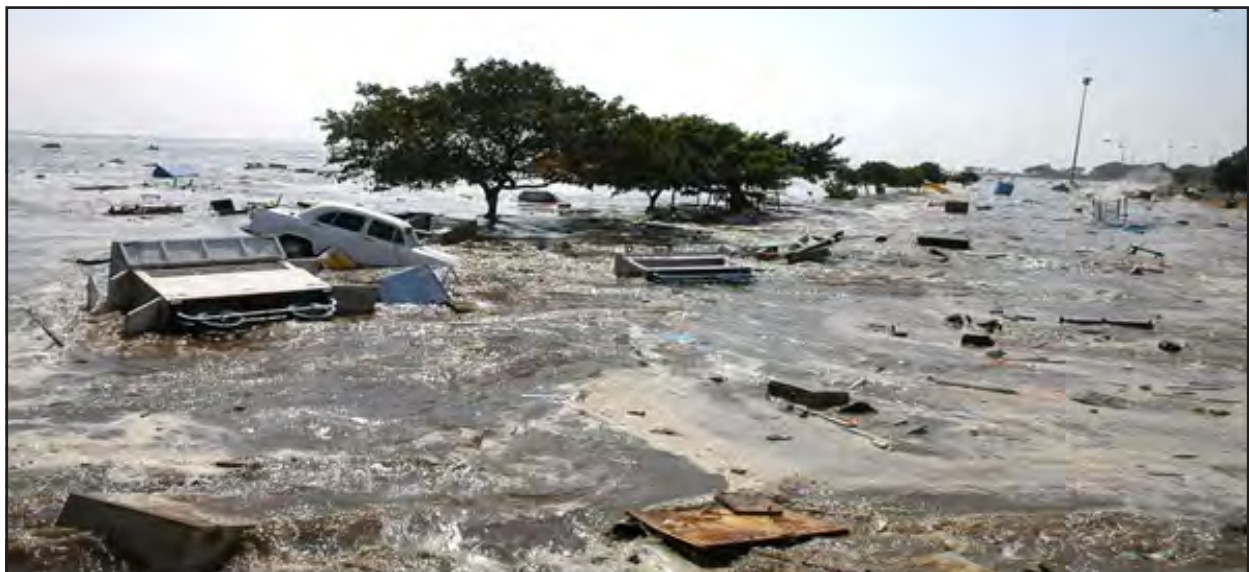
Figure 5.7 : A general view of the scene of Marina beach in Chennai, India, On December 26, 2004, after tsunami wave hit the region. Waves devastated the southern Indian coasttime killing an estimated 18,000 People.