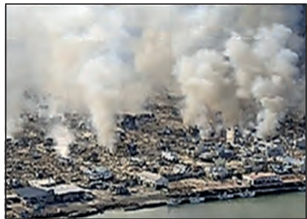
Figure 5.6 : Japan Tsunami Fukushima Daichi Nuclear disaster , 14 th March,2011